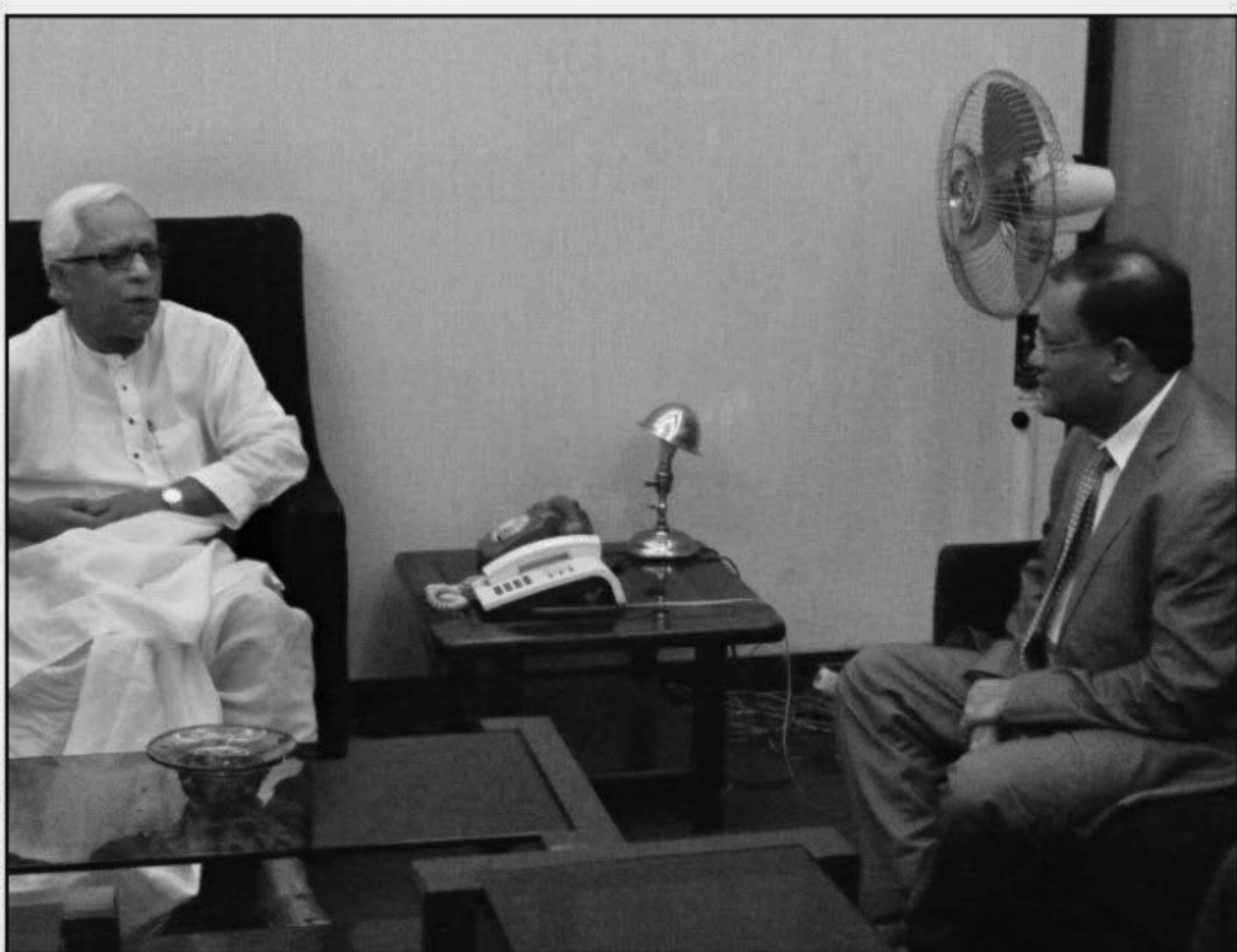
State Minister for Environment and Forest Dr Hasan Mahmood calls on Chief Minister of West Bengal Buddhadeb Bhattacharya at the latter's office in Writers' Building, Kolkata yesterday.

Dhaka Metropolitan Police (DMP) Commissioner AKM Shahidul Hoque informed the High Court (HC) yesterday that the police have not set up any billboard in the capital for commercial purpose. The police set up some billboards containing awareness messages about traffic rules to raise awareness among the people, he said in a report submitted to the court through the attorney general's office. Meanwhile, Officer-in-Charge (OC) of Shahbagh Police Station Rezaul Karim appeared before the High Court (HC) yesterday and made unconditional apology for not cooperating with the Dhaka City Corporation (DCC) in dismantling unauthorised billboards last month. He told the court through his lawyer that a group of students had created obstacles to demolition of unauthorised billboards by DCC on March 18 and the police tackled the situation. The HC bench of Justice AHM Shamsuddin Chowdhury Manik and Justice Md Delwar Hossain exempted the OC of charges.