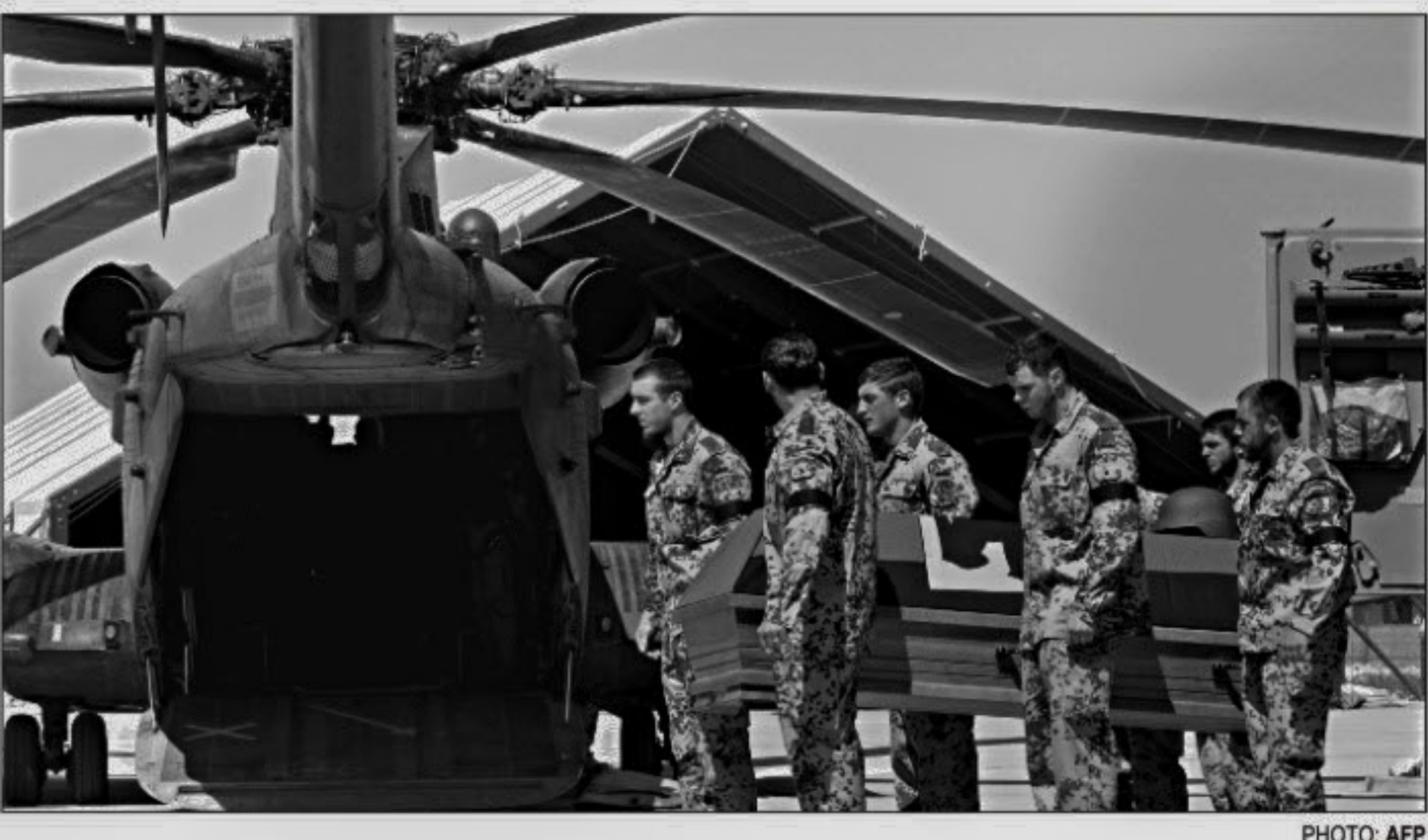
This handout photo made available by the German government press office shows German soldiers carrying a coffin towards a helicopter after a memorial service for the three German soldiers killed during fighting with the Taliban two-days earlier in Kunduz, Afghanistan yesterday. The remains of the soldiers are to be flown back to Germany later in the day.

AFP, Srinagar Indian troops yesterday shot dead two suspected militants after they sneaked into Indian Kashmir from the Pakistani zone of the disputed region, an army spokesman said. The two were killed along the Line of Control (LOC) -- the de facto border that splits Kashmir between nuclear-armed rivals India and Pakistan -- in the northern Keran sector, spokesman J.S. Brar said. It was the second infiltration attempt in the rugged and mountainous area within a week. India's military said last month around 400 militants were poised to cross into Indian Kashmir from the Pakistani zone of the scenic Himalayan region.