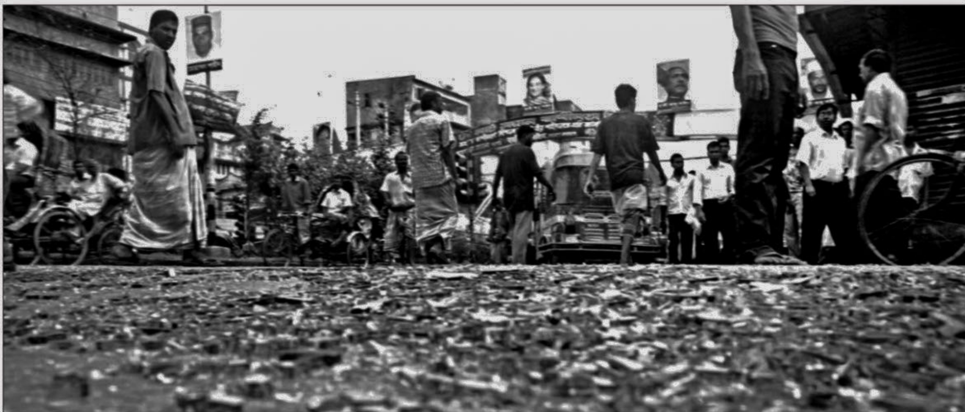
Local businessmen and hawkers clash with police and vandalise vehicles when the law enforcers try to dismantle makeshift shops built illegally on a footpath at North South road in the city yesterday as part of Clean Dhaka Programme.