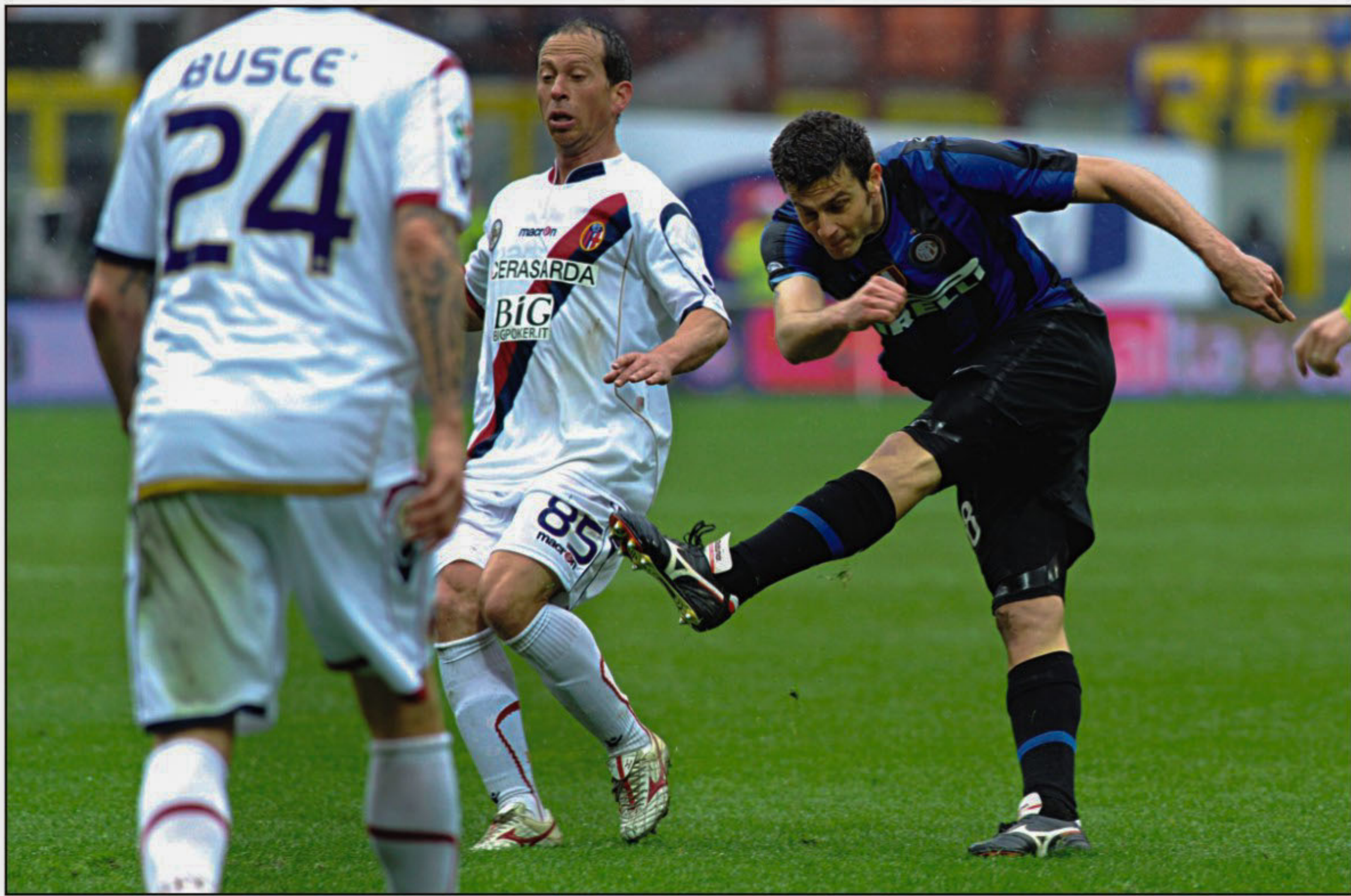
Inter Milan midfielder Thiago Motta (R) scores the opening goal against Bologna during their Serie A encounter at San Siro on Saturday.