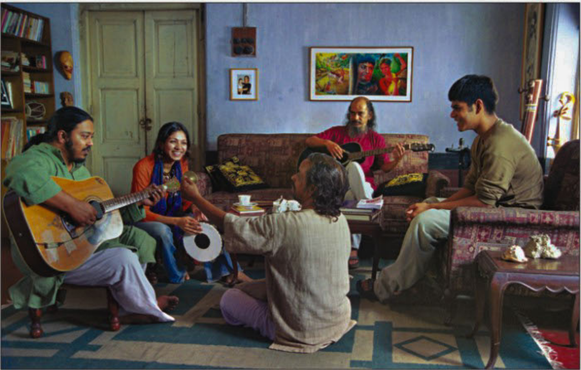
A scene from the film "Ontorjatra".

The exhibition will remain open from 11am to 7pm.