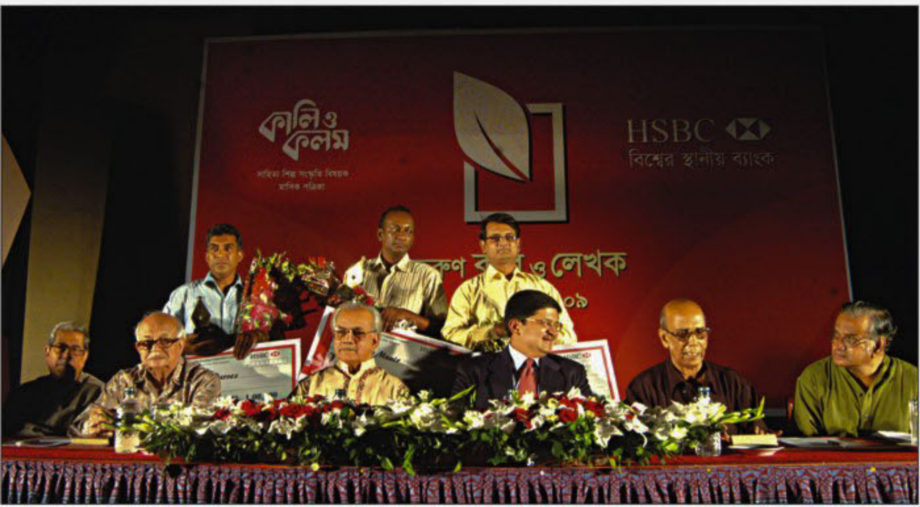
Awardees (back row) with eminent personalities.