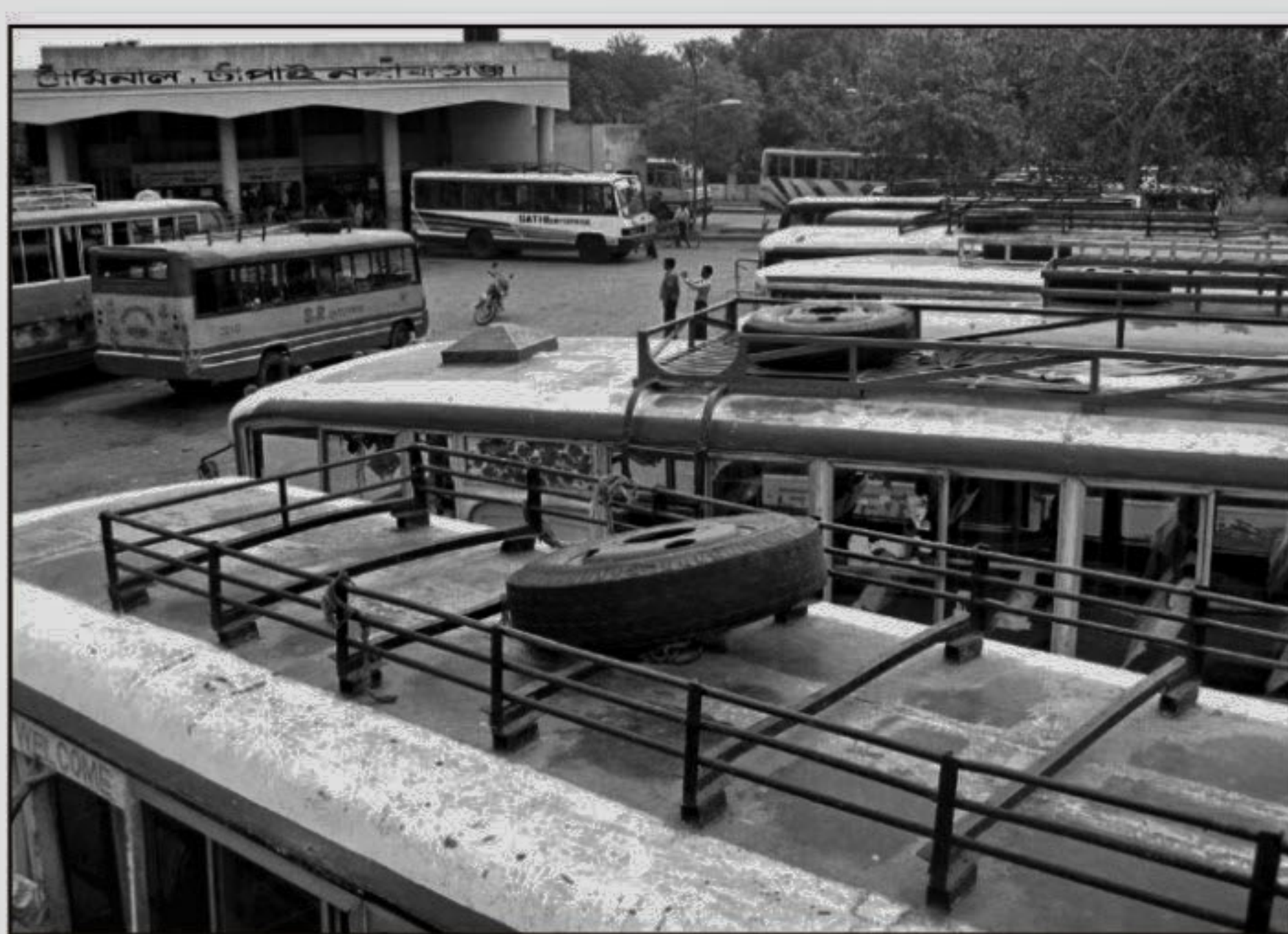
Buses lie idle at the central bus terminal in Chapainawabganj town yesterday as transport owners and workers stopped running them on Chapainawabganj-Rajshahi route following clashes between the transport workers of the two districts on Tuesday night.

Police also unearthed two factories that produce second-hand transformers.