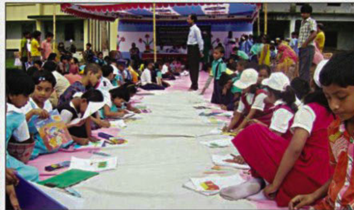
Young participants at the art competition.