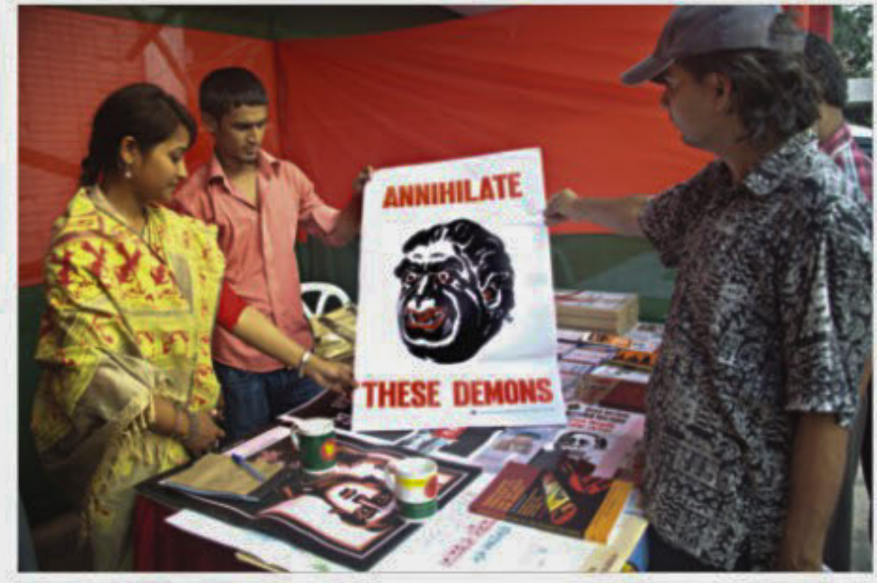
A visitor at Liberation War Museum Stall.