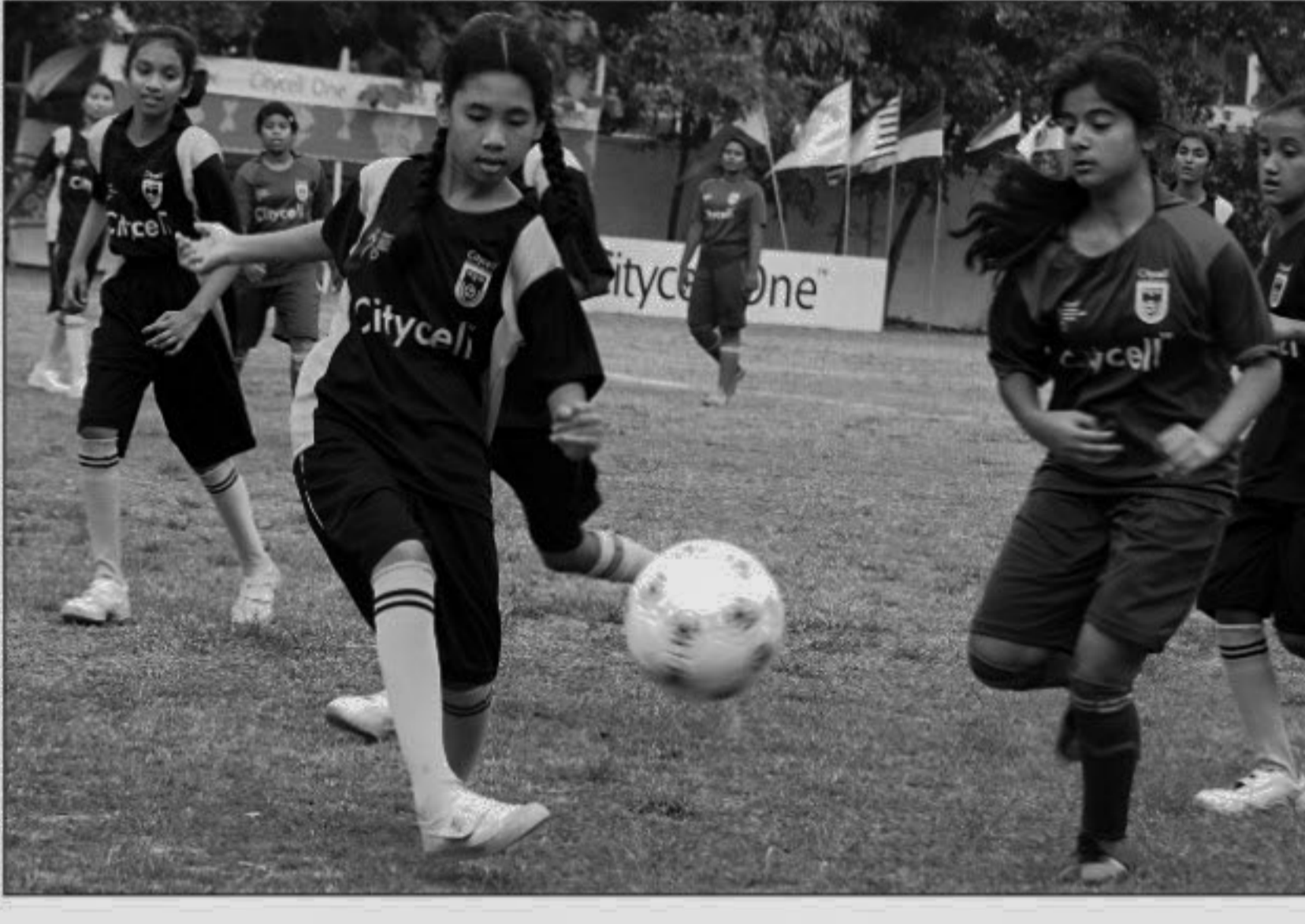
Scene from yesterday's Citycell Dhaka Metropolitan School Football Championship match between Green Herald International School and Summerfield International School at the Sultana Kamal Women's Sports Complex in Dhanmondi yesterday.

Paul Collingwood (captain), James Anderson, Ravi Bopara, Tim Bresnan, Stuart Broad, Craig Kieswetter, Michael Lumb, Eoin Morgan, Kevin Pietersen, Ajmal Shahzad, Ryan Sidebottom, Graeme Swann, James Tredwell, Luke Wright, Michael Yardy.