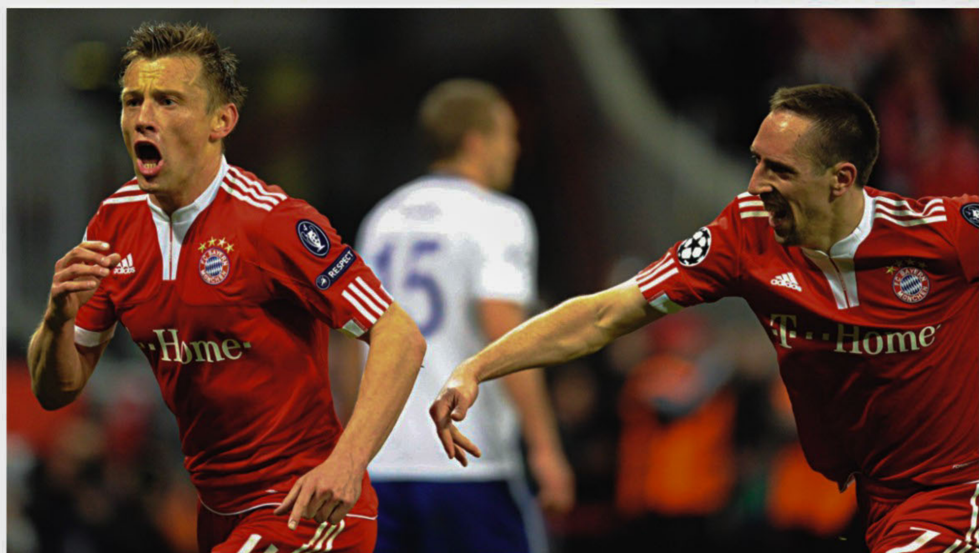
Bayern Munich striker Ivica Olic (L) is ecstatic after scoring the winning goal against Manchester United during their Champions League quarterfinal at the Allianz Arena on Tuesday.