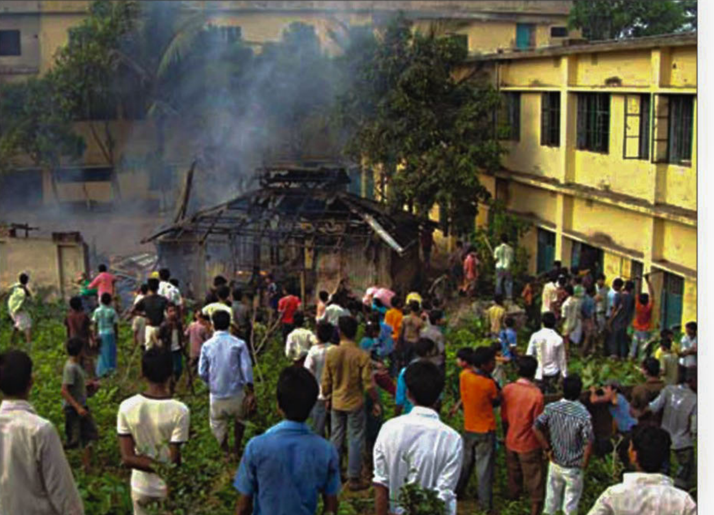
A few hundred people attack the Cox's Bazar Adarsha Mohila Kamil Madrasa near Central Bus Terminal and torch its kitchen. They also set ablaze the dormitory for orphan students and the madrasa's computer lab yesterday.

60 hurt in clashes A CORRESPONDENT, Cox's Bazar At least 60 people including 14 policemen, 12 teachers and girl students were injured as several hundred people attacked a girls' madrasa in Cox's Bazar yesterday. Adarsha Mohila Kamil Madrasa located to the south of Central Bus Terminal in Cox's Bazar came under attack around 2pm. The attackers broke all the boundary walls of madrasa. They hurled brickbats and vandalised the main building and the teachers' hostel. They also set the female dormitory and computer lab on fire. The incident happened as the madrasa was allegedly built on the land of a graveyard. Police and witnesses said the attackers looted 24 sacks of rice and five sacks of potato. SEE PAGE 15 COL 2