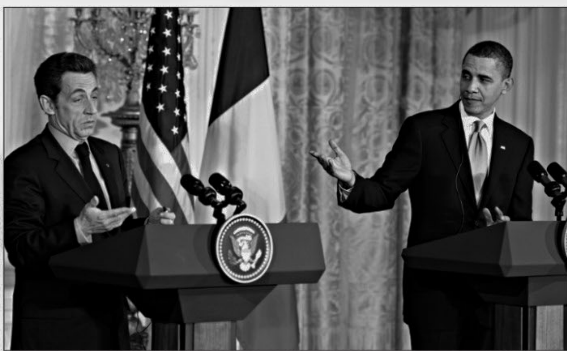
US President Barack Obama listens as his French counterpart Nicolas Sarkozy speaks during a joint press conference in the East Room of the White House in Washington on Tuesday following their meeting.