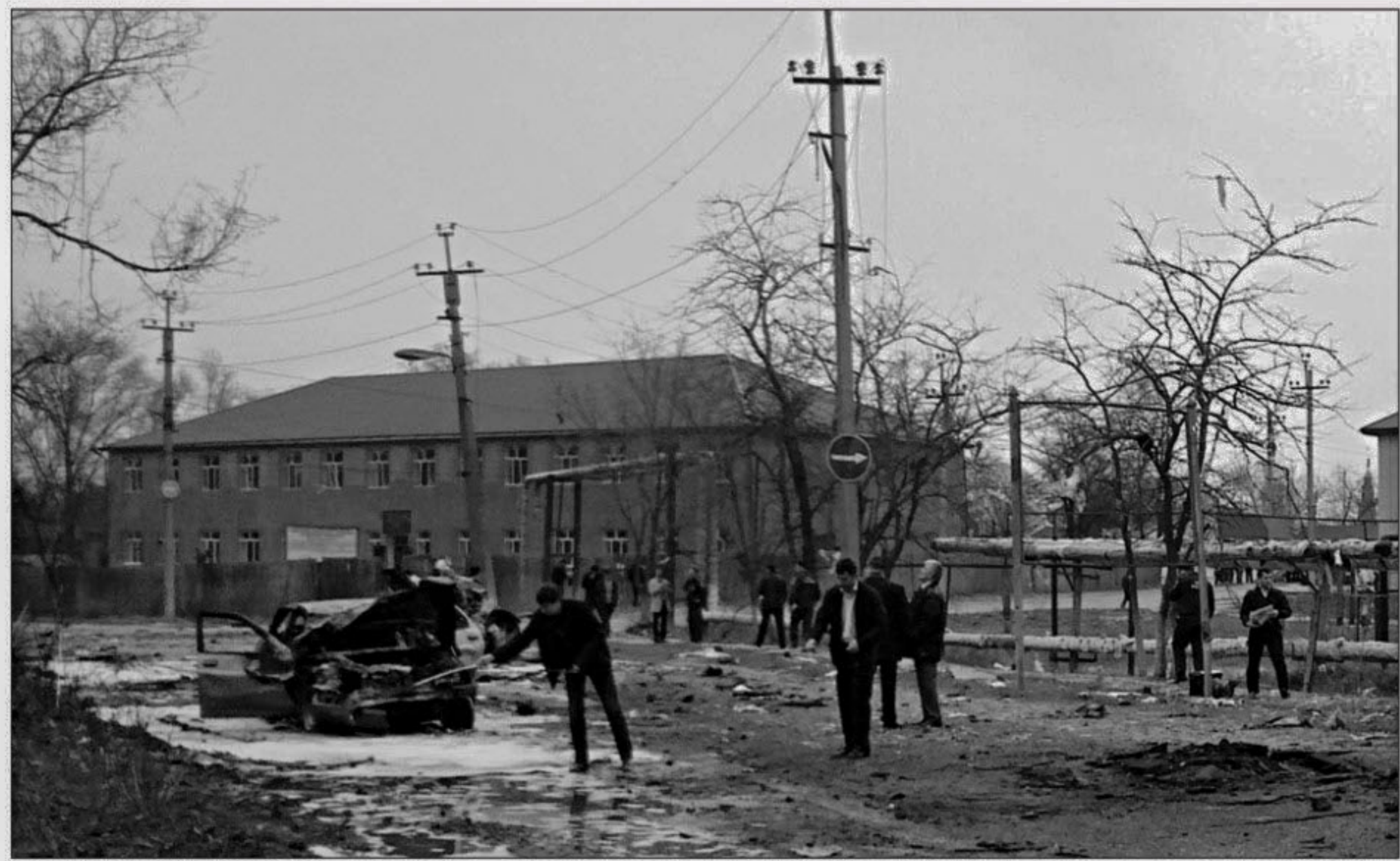
Russian forensic investigators and security personnel examine the site of a bomb attack in Kizlyar yesterday. A suicide bomber disguised as a police officer set off one of two blasts that killed 12 people in Russia's volatile North Caucasus, just two days after attacks in Moscow left 39 dead.

Rebels from the North Caucasus, which includes Dagestan and Chechnya, were blamed for masterminding the Moscow attack, but no claims of responsibility have been made. Speculation has been rife that the attacks were retaliation for the recent killing of high-profile separatists in the North Caucasus by police.