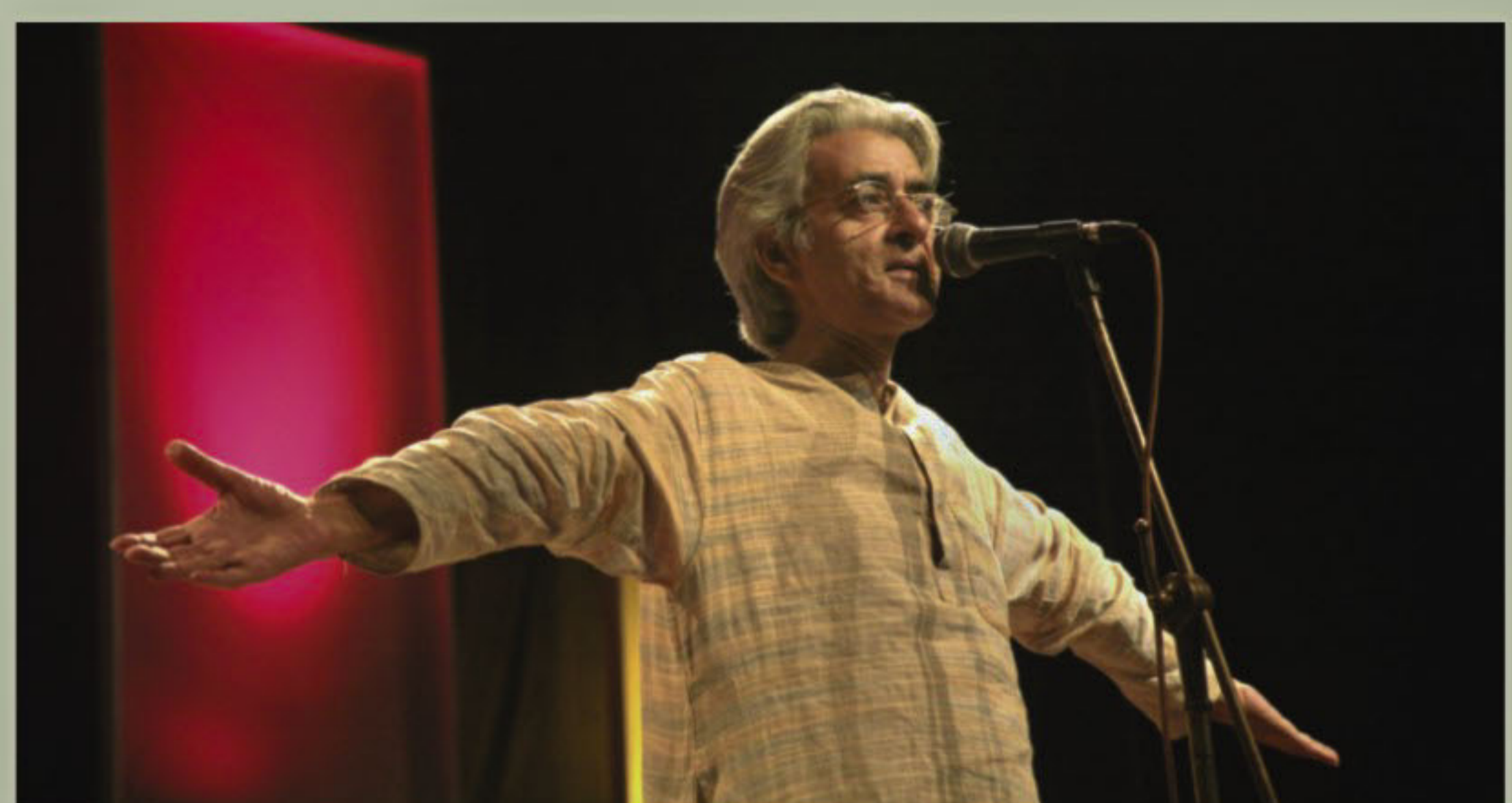
This was Pratul Mukhopadhyay's first performance in Bangladesh.

The programme featured renditions of 20 songs by the famed singer-songwriter-composer. Throughout the two-hour concert, Mukhopadhyay's vocals worked magic on the full-house audience. The response from the audience moved him to tears. "I'll leave Bangladesh with an impression that after my departure my songs would inspire more people," he said.