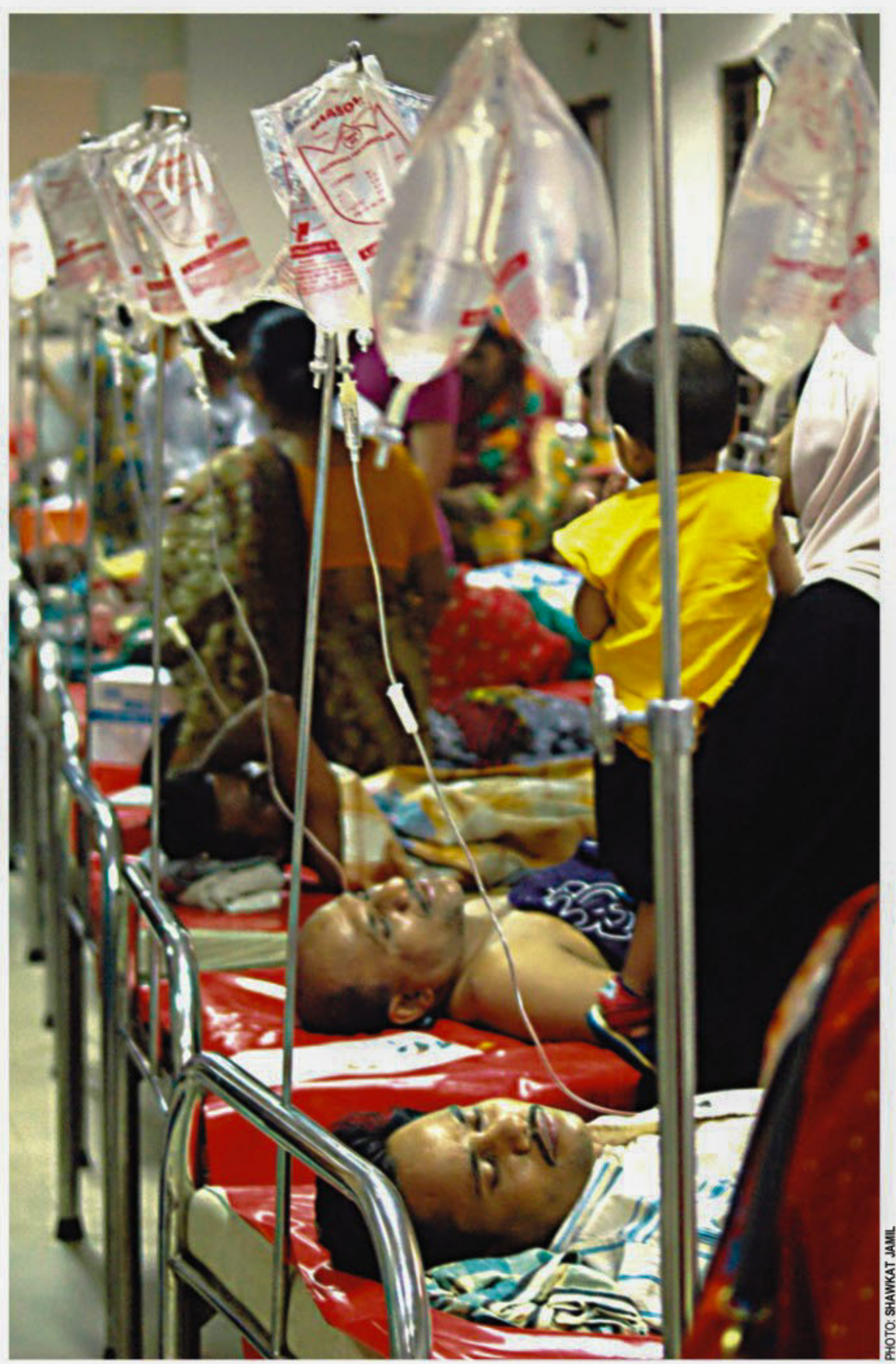
Experts say a sharp rise in diarrhoeal diseases usually occur between the months of March and May every year. Besides, smelly and dirty water supplied by the Wasa add to the woes this year. This photo taken yesterday shows diarrhoea patients under treatment at ICDDR,B.