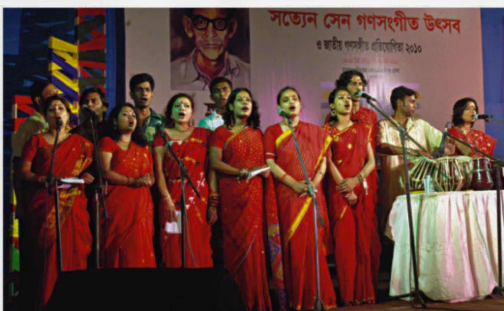
Artists of Swabhumi sing at the programme.