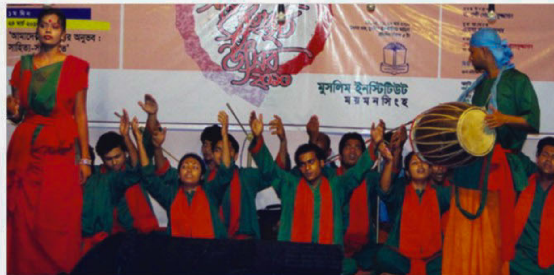
Artistes of Udichi Shilpi Goshthi sing at the event.