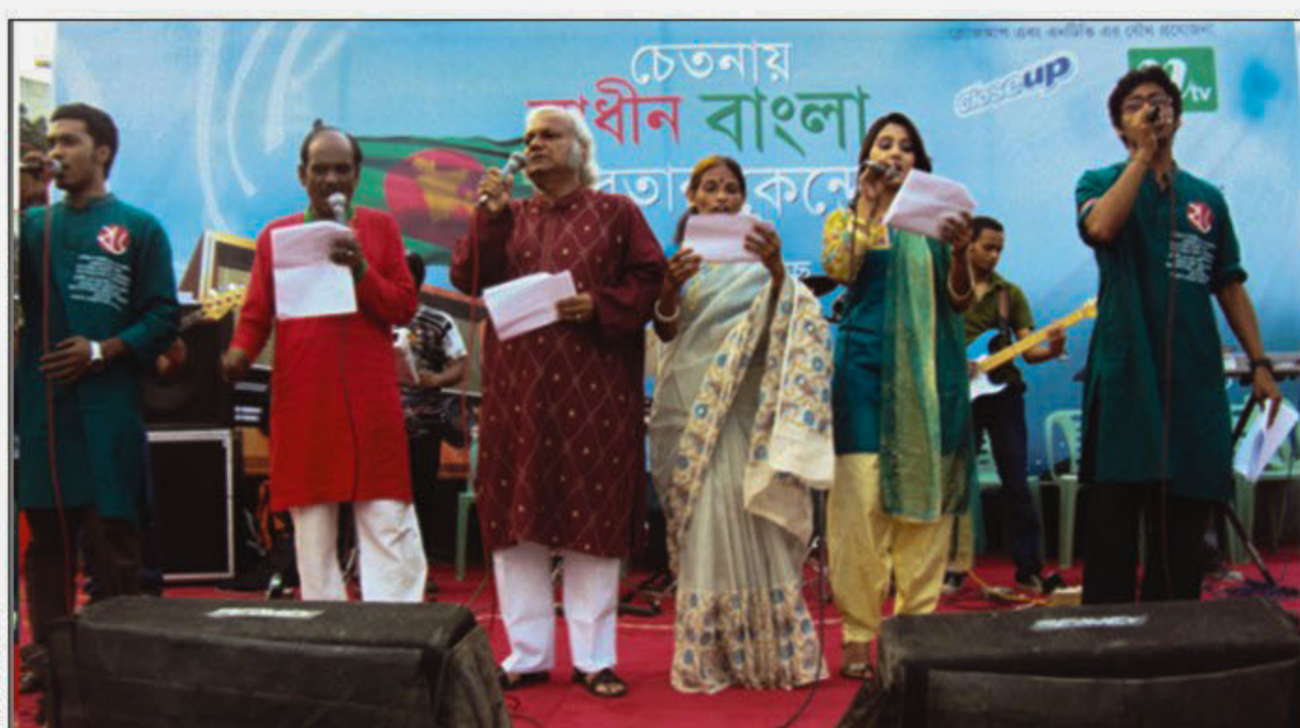
Swadheen Bangla Betar Kendra artistes along with upcoming singers perform at the event.

The album, which comprises five CDs, contains 46 songs of SBBK singing by