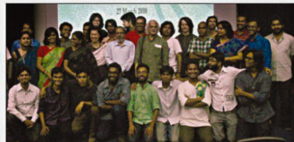
The chief guest (centre) seen with organisers and participants of the workshop.

The workshop focused on developing the participants' understanding of documentary filming from creative and