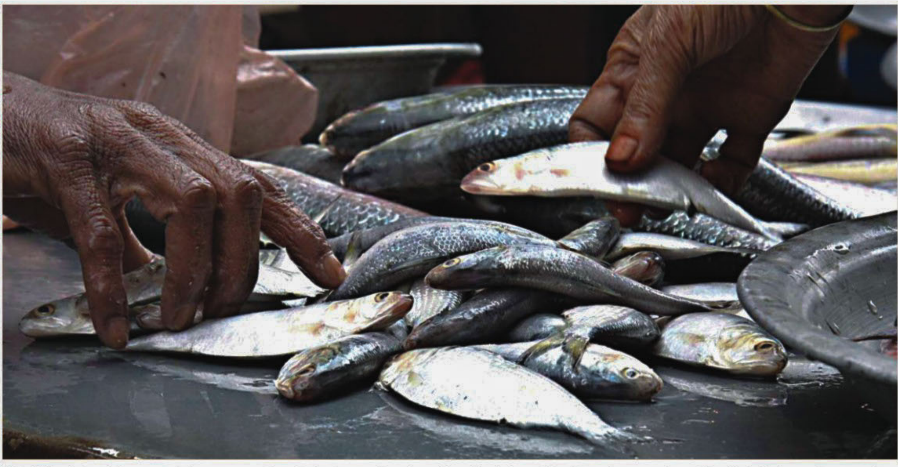
Sale of Hilsa fry, locally known as Jatka , goes on unabated in the city even though catching of the fry is prohibited. The photo was taken at Dhupkhola kitchen market yesterday.

The government will deploy army personnel soon to help ease water crisis in the capital. The decision came at a regular cabinet meeting yesterday with Prime Minister Sheikh Hasina in the chair. Highly placed sources told The Daily Star that the prime minister decided to deploy the army to ensure the smooth supply of water in crisis areas of the capital. On Sunday, some senior Awami League leaders suggested deploying army men to tackle the problem. Taqsem A Khan, managing director of Wasa, said troops are expected to be engaged on April 1 to help Wasa in water management and maintaining SEE PAGE 15 COL 3