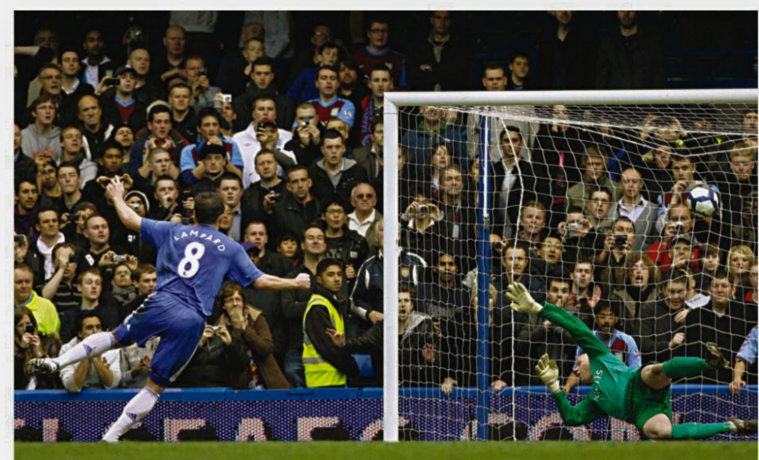
Chelsea midfielder Frank Lampard (L) hammers home his first penalty kick past the despairing dive of Aston Villa goalkeeper Brad Friedel in their Premier League match at Stamford Bridge in London on Saturday.