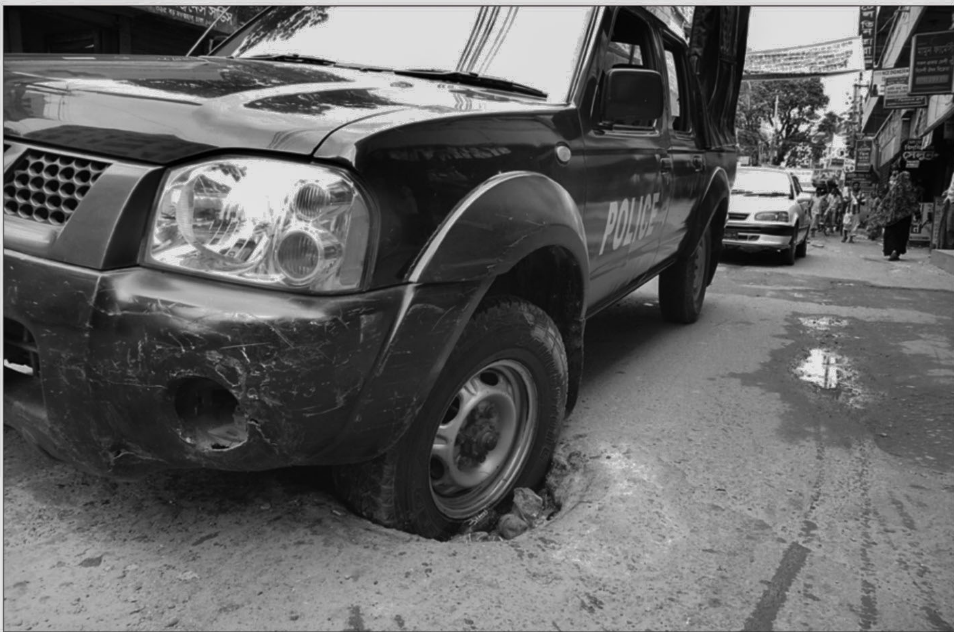
A wheel of a police van got stuck in a pothole near Maghbazar mosque in the city yesterday. Potholes have developed on many roads, hampering smooth movement of vehicles, but the authorities remain indifferent to the problem.

The US president said: "Here at home, those Americans who can trace their roots to Bangladesh continue to be active in all industries, and are an important part of our communities. On this Independence Day, I wish them all the best."