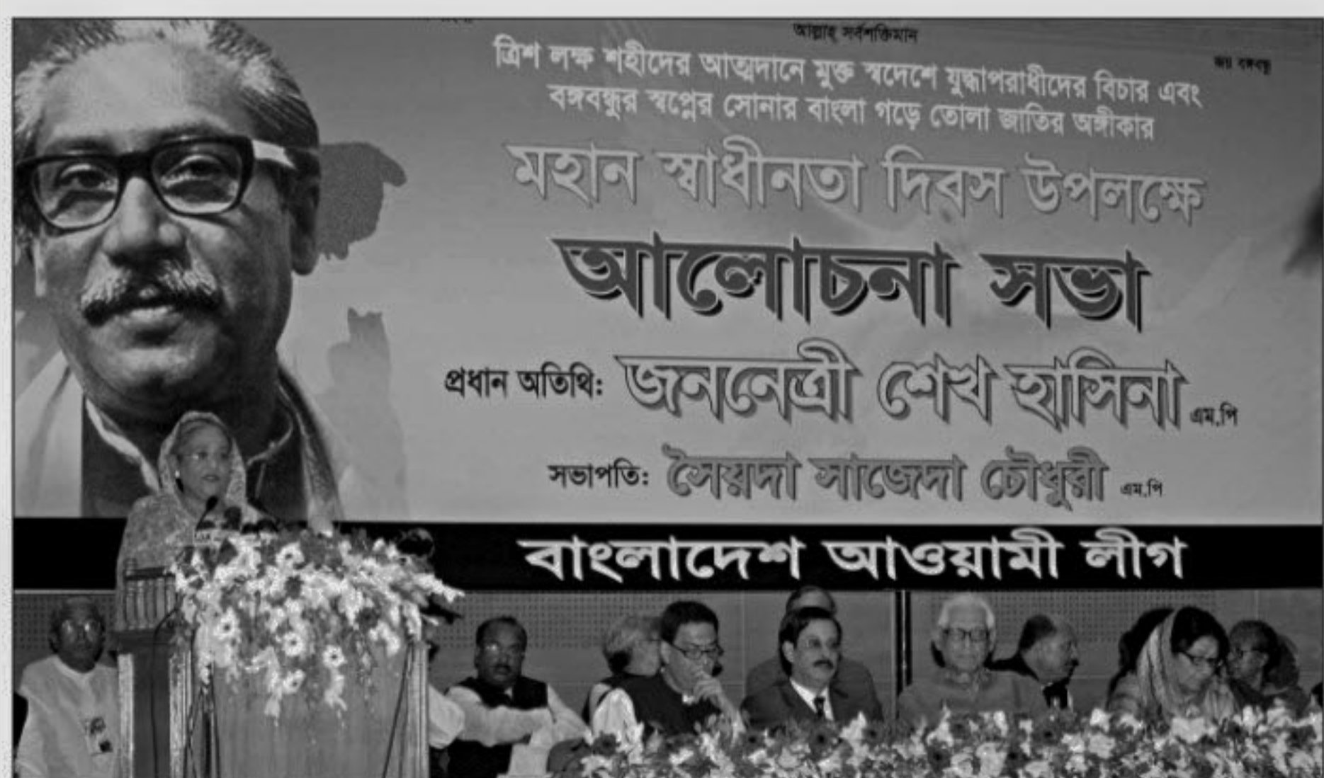
Prime Minister Sheikh Hasina speaks at a discussion marking the Independence Day at Bangabandhu International Conference Centre in the city yesterday. Awami League organised the discussion. (Story on Page 1)