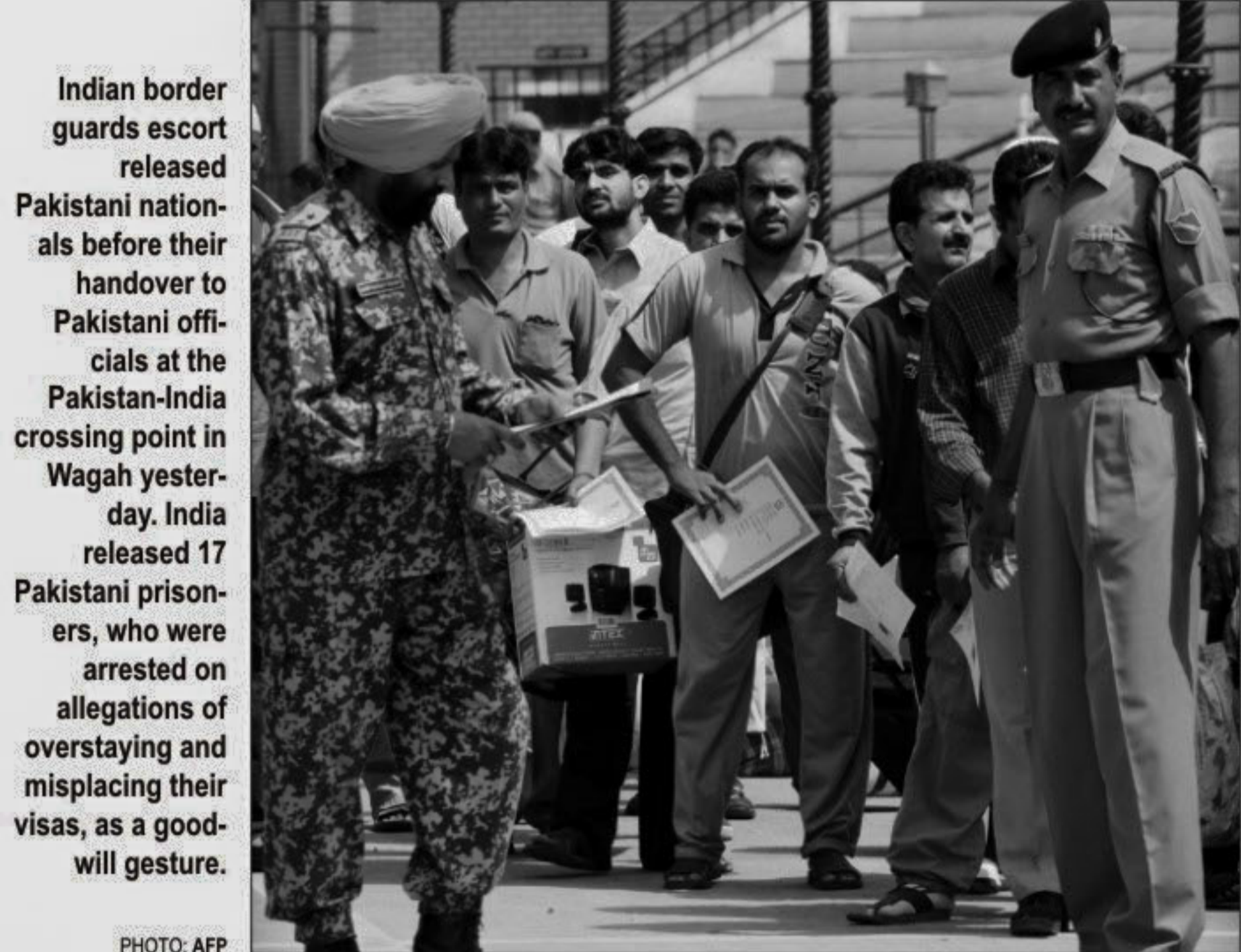
Indian border guards escort Pakistani nationals before their handover to Pakistani officials at the Pakistan-India crossing point in Wagah yesterday. India released 17 Pakistani prisoners, who were arrested on allegations of overstaying and misplacing their visas, as a goodwill gesture.

The destruction of the 16th century mosque by Hindu fanatics in the northern town of Ayodhya triggered some of the worst Hindu-Muslim violence since the partition of the Indian sub-continent in 1947. Around 2,000 people were killed in the communal riots, which left an enormous tear in India's secular fabric and permanently tarnished 82-year-old Advani and fellow figures from the Bharatiya Janata Party (BJP).