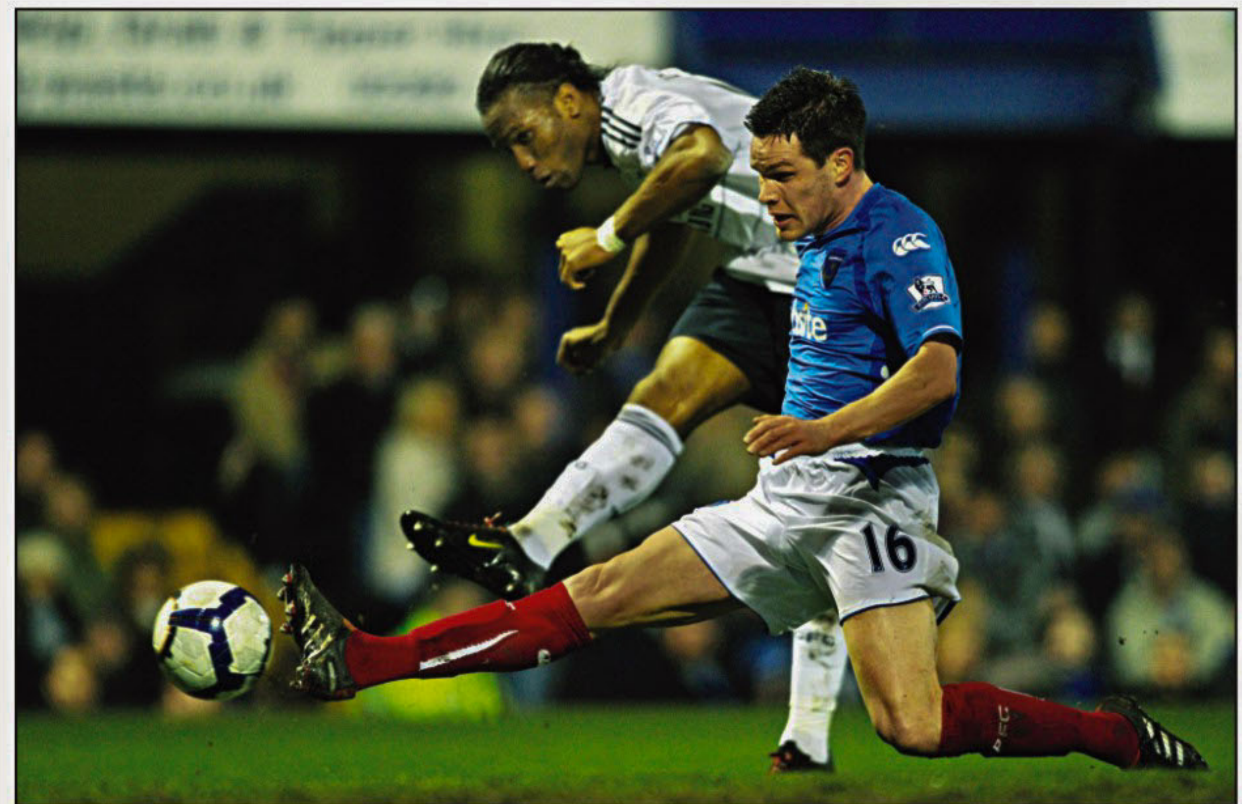
Portsmouth defender Steve Finnan (R) slide tackles Chelsea striker Didier Drogba during their Premier League clash at Fratton Park on Wednesday.

Goals in either half from the first division club's Marko Marin and Claudio Pizarro put paid to their second division rivals.