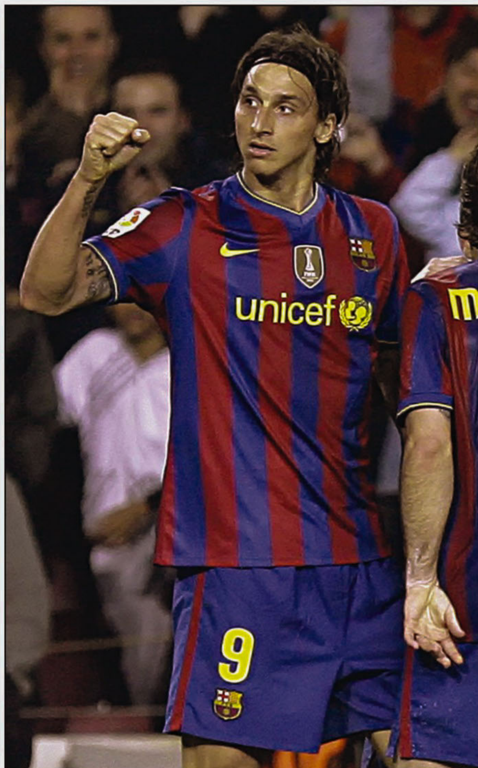
Barcelona striker Zlatan Ibrahimovic pumps his fist after scoring the opening goal against Osasuna during their Primera Liga encounter at Nou Camp on Wednesday.

He resigned in 1992 after France exited the European Championships at the first round and turned his attentions towards football administration notably the organisation of the 1998 World Cup in France.