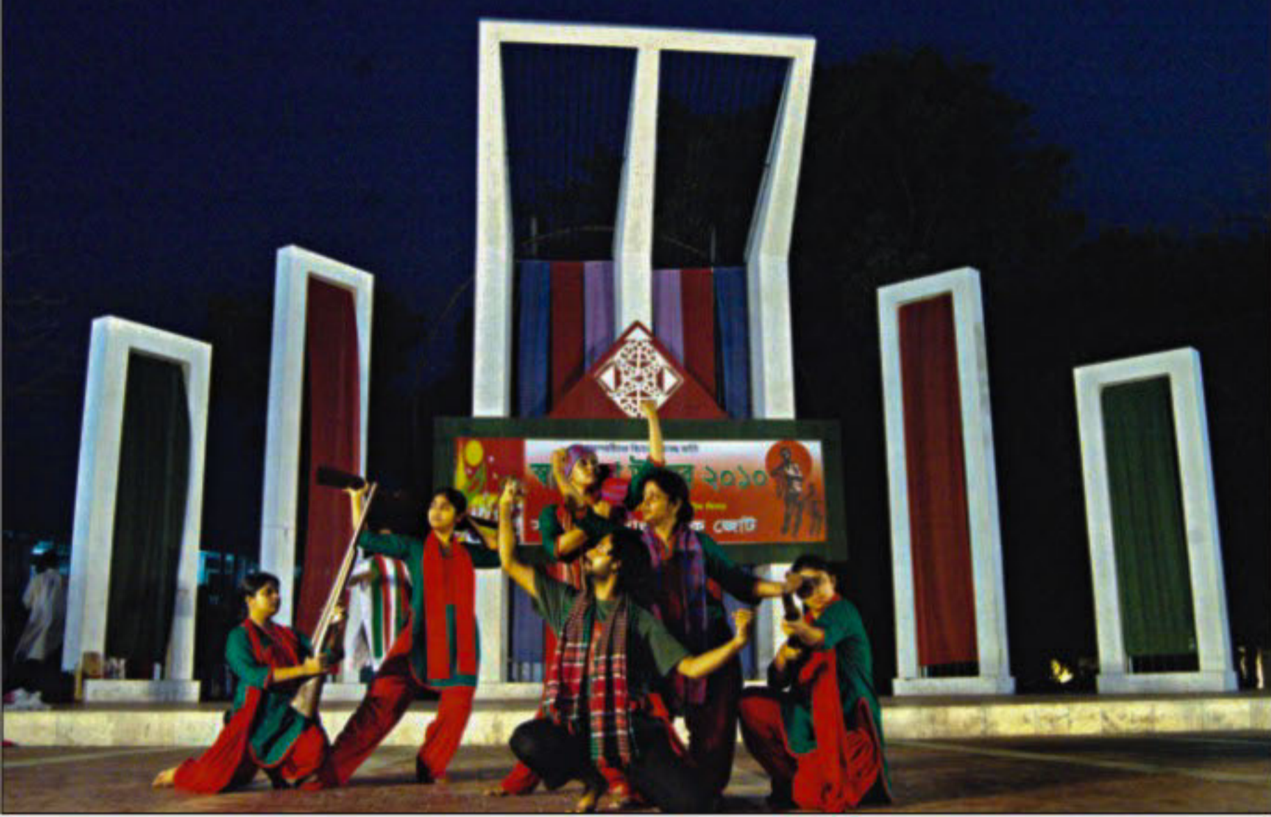
Dancers of Nataraj perform at the festival.