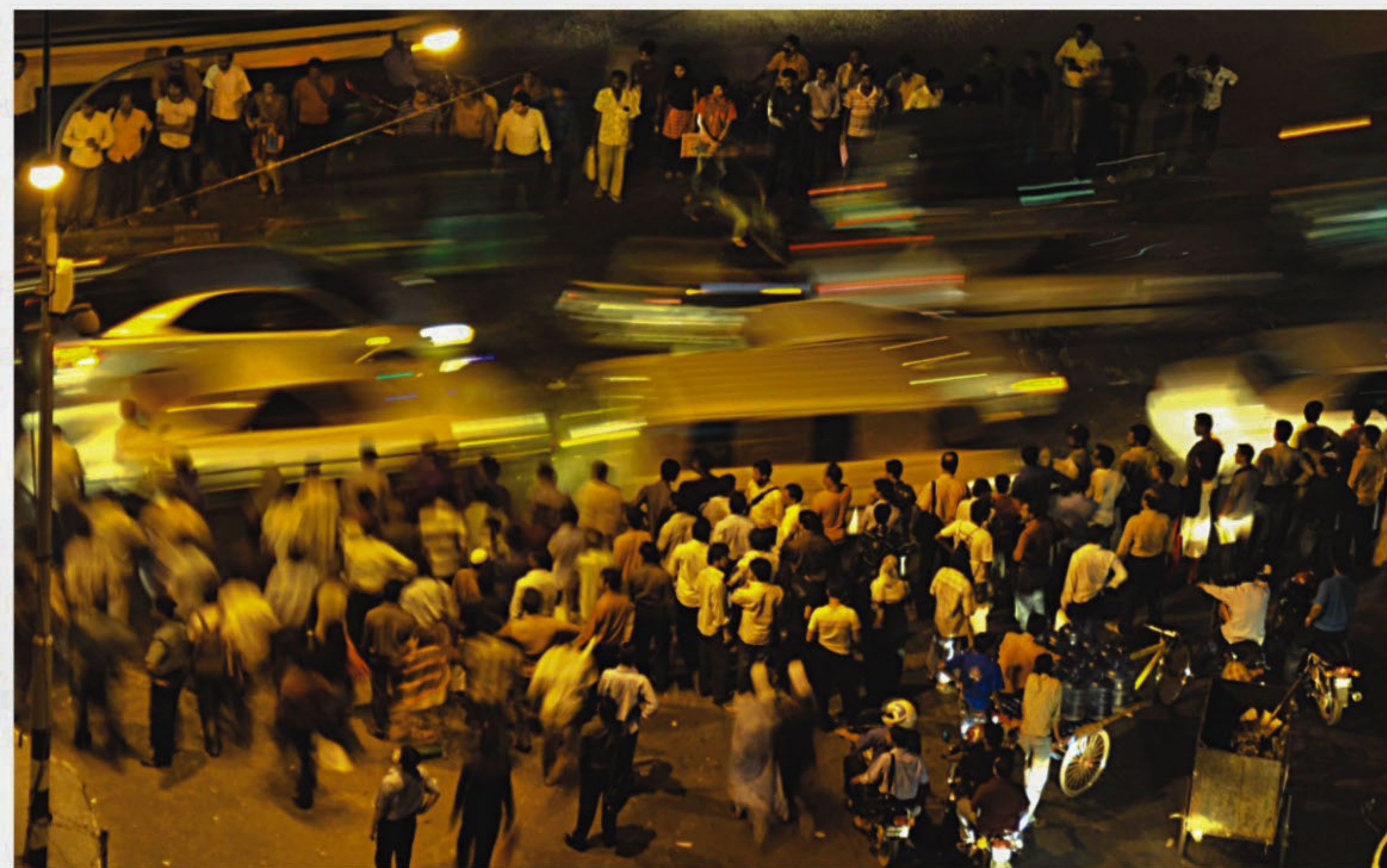
A typical evening at Sonargaon intersection. People rush home regardless of the risk they are taking while jaywalking. Lives can be saved if only people act safe and use the underpass just yards away.

BSS, Dhaka The Energy Division of the Ministry of Power, Energy and Mineral Resources yesterday directed the Petrobangla to allocate more gas to the power sector to help reduce the frequent power outage and keep the load-shedding within a tolerable level. It also asked the Petrobangla officials to work on gas staggering issue or explore the way to stop the misuse of gas to further accelerate power generation in the country. A decision to this effect came at an emergency SEE PAGE 15 COL 2