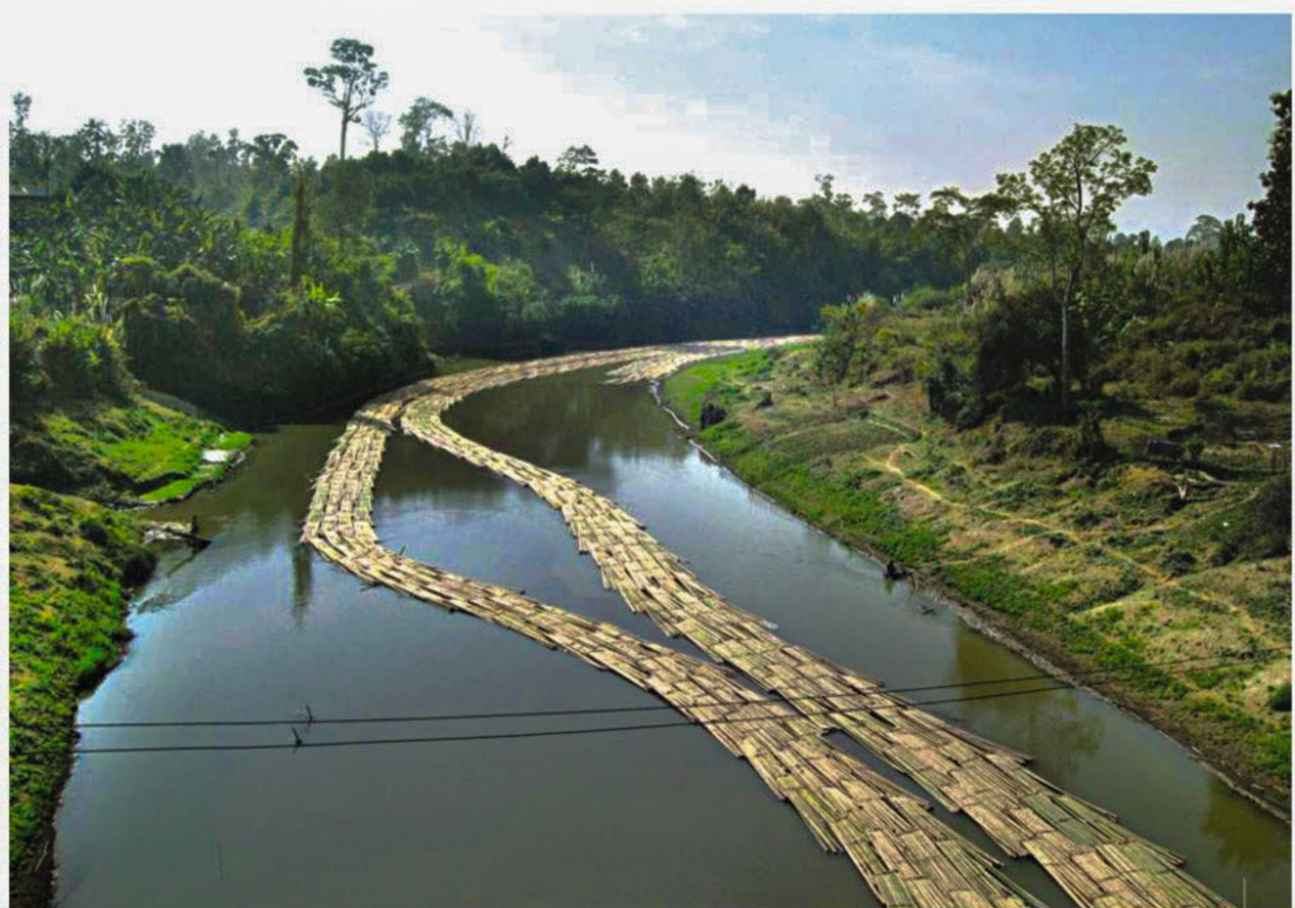
The Kachalong river in Baghaichhari upazila of Rangamati has forever been a conventional waterway for transporting bamboo. Siltation has narrowed down the river almost to a canal putting transport of goods at stake.