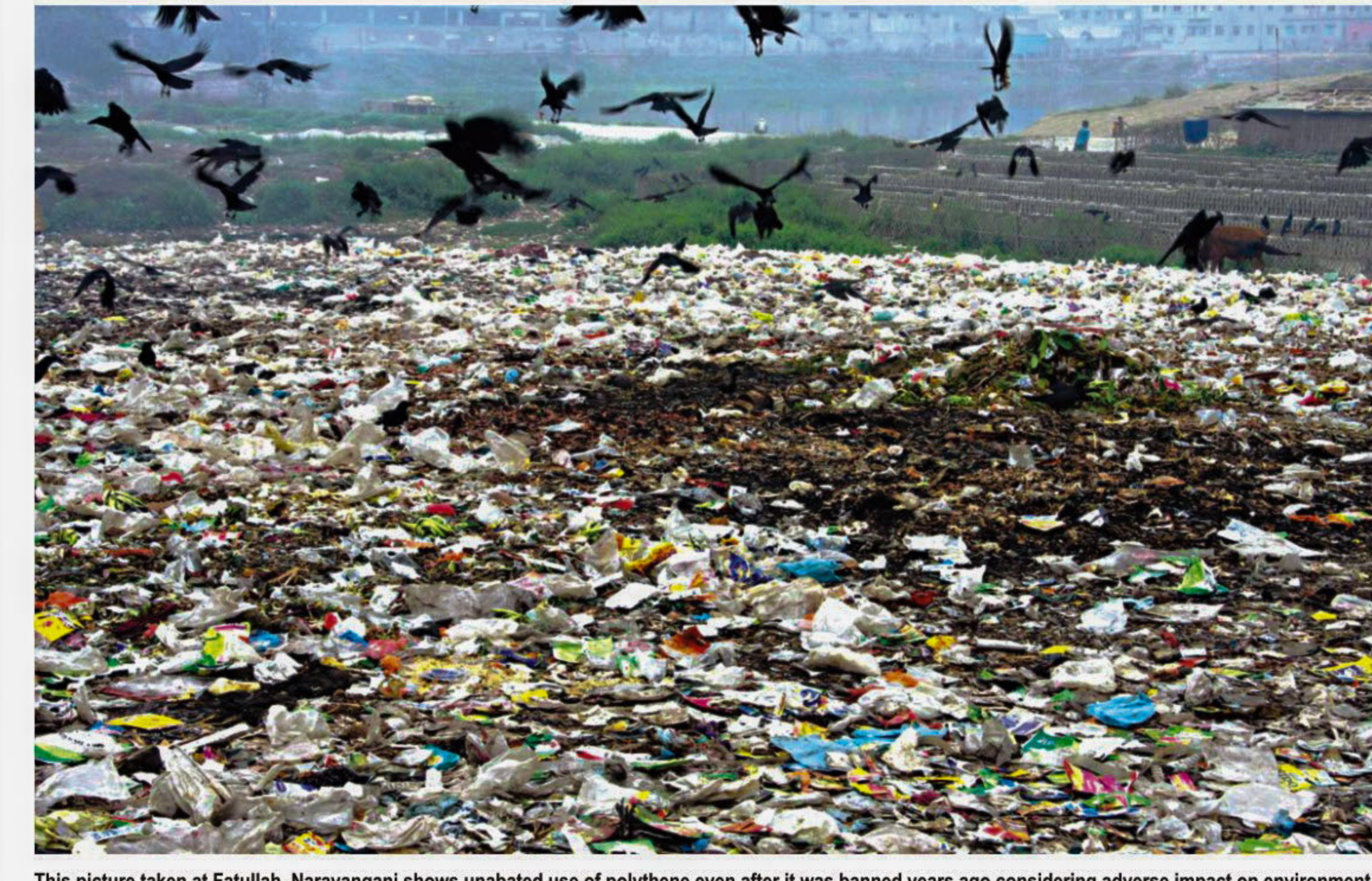
This picture taken at Fatullah, Narayanganj shows unabated use of polythene even after it was banned years ago considering adverse impact on environment.