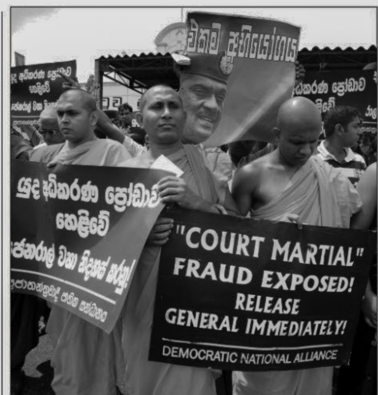
Sri Lankan Buddhist monks join Democratic National Alliance supporters protesting in Colombo on Tuesday demanding the release of former army chief Sarath Fonseka, who attempted to unseat the president in January elections.

"An order to reopen cases abroad would be tantamount to putting Benazir Bhutto's grave on trial, which is against all norms of justice, decency, morality and the law," the petition said while adding that the apex court had made several mistakes by declaring the NRO 'unconstitutional.'