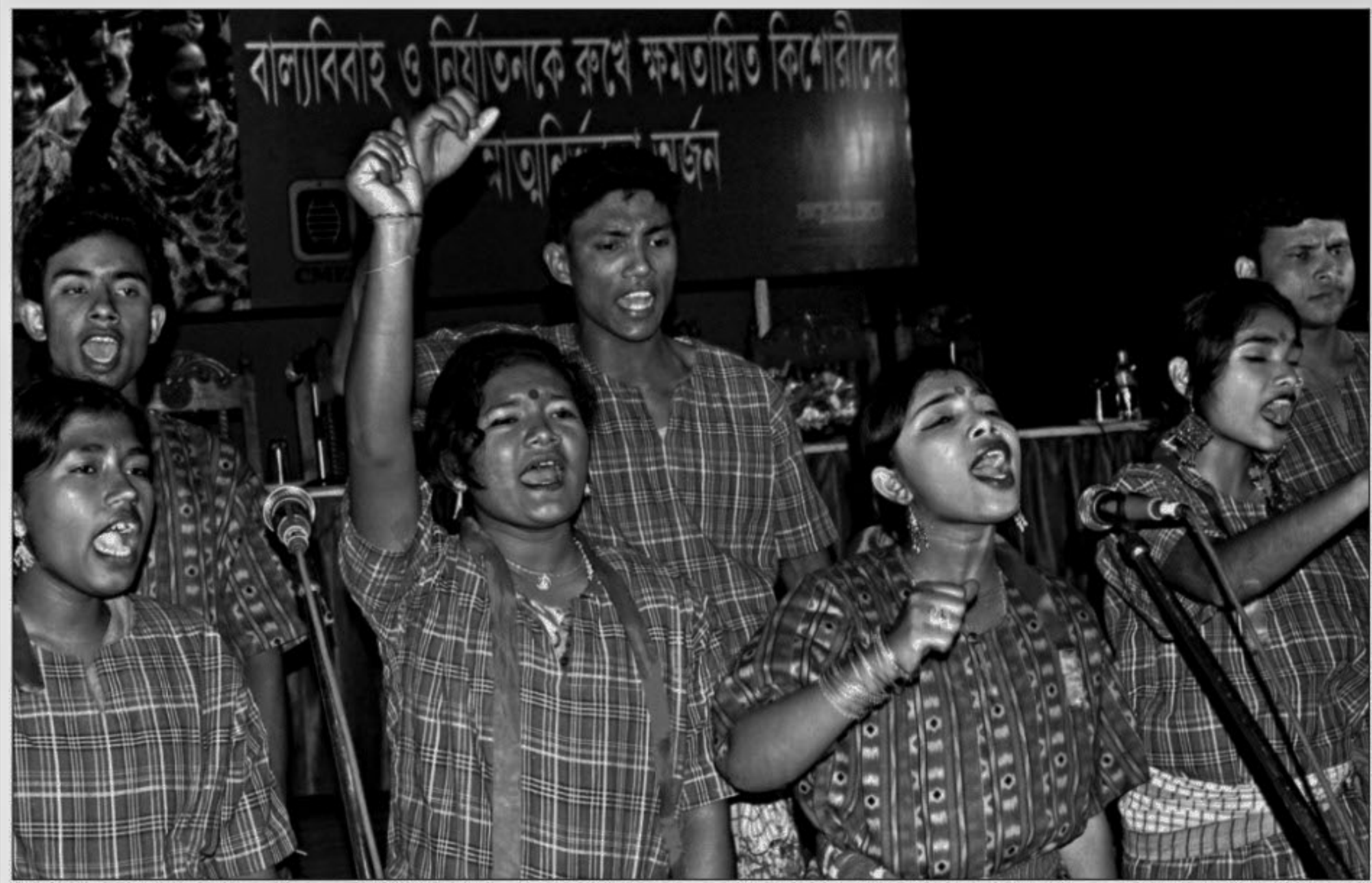
Young learners render a song at a seminar at Chhayanaud auditorium in the city yesterday. Centre for Mass Education in Science in cooperation with Manusher Jonno Foundation organised the event.

Three documentaries were screened at the seminar focusing on different successes of CMES to prevent child marriage, repression on female adolescents and achieve economic self-reliance.