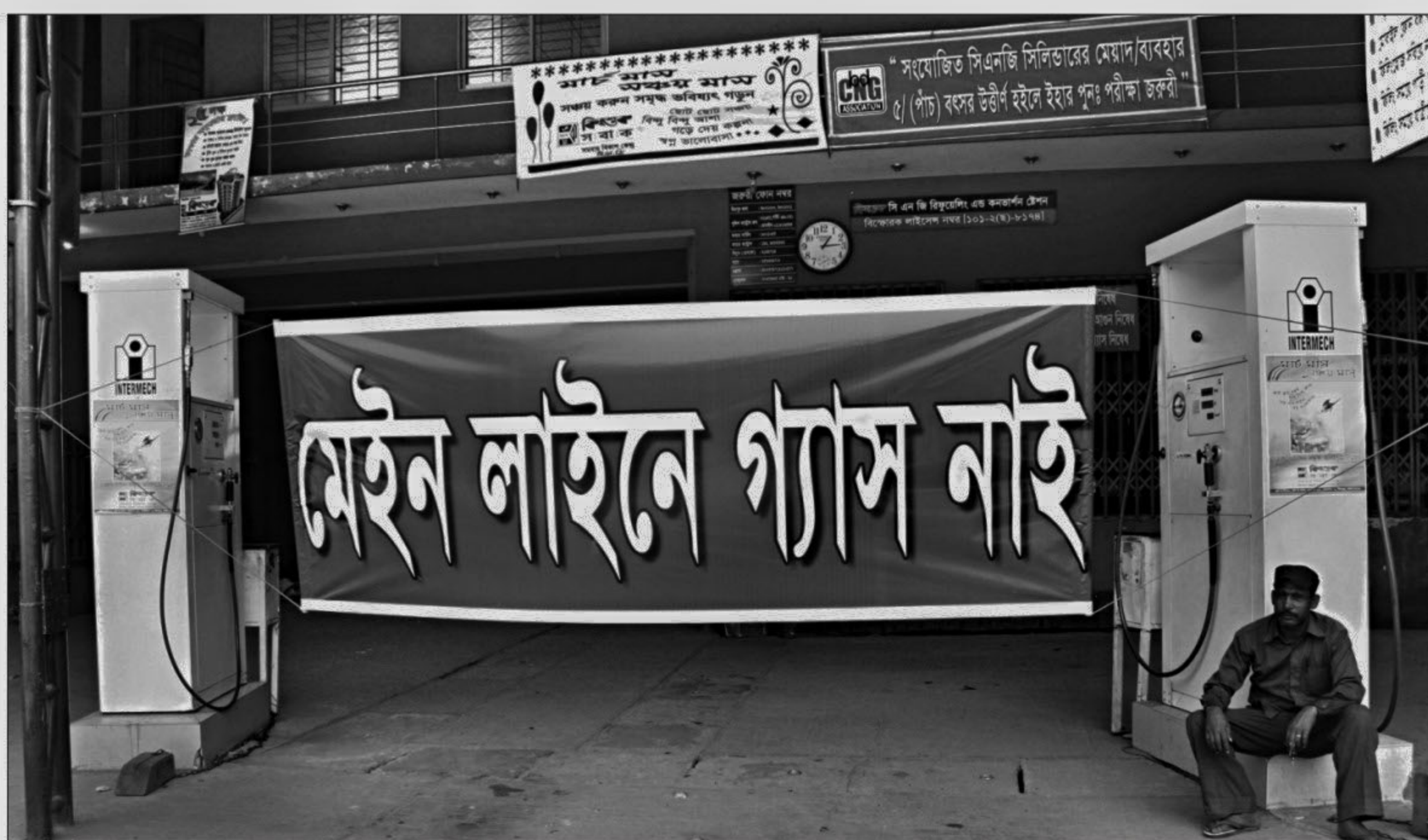
A banner inscribing 'No gas in main line' was posted in front of a CNG refuelling station near Mirpur stadium in the city as the station has been suffering from huge scarcity of gas for the last one month. The photo was taken yesterday.

ASP Munshi Atique filed charge sheet in the case on March 20 that year against 10 persons.