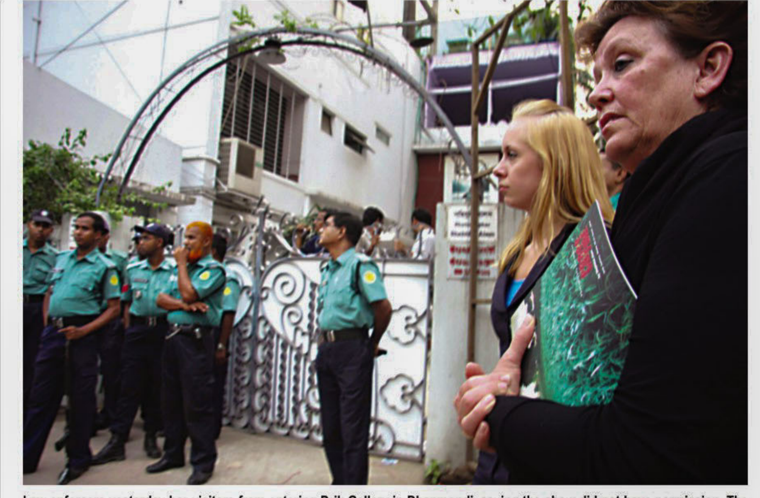
Law enforcers yesterday bar visitors from entering Drik Gallery in Dhanmondi, saying the show did not have permission. The gallery organised an exhibition on extrajudicial killings.