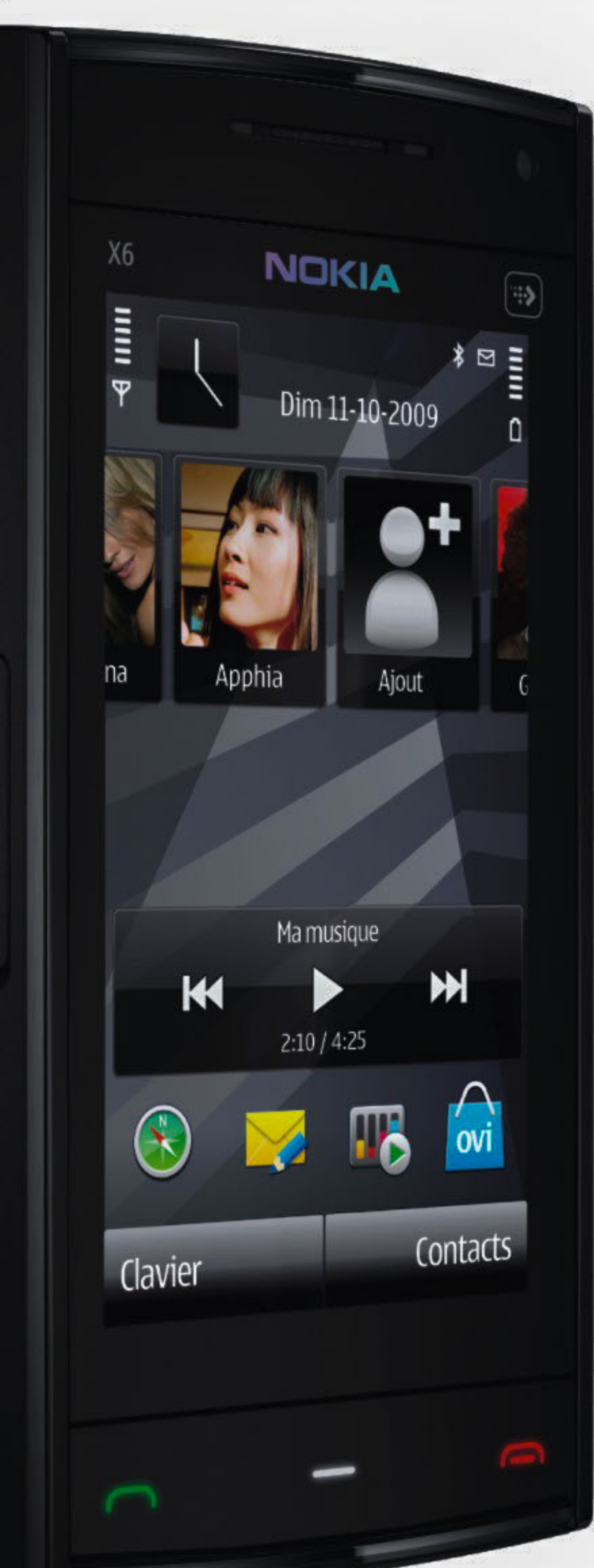
Nokia X6-00 MRP BDT 30,800

TOUCH. PLAY. COME GET ENTERTAINMENT nokia.com.bd/play