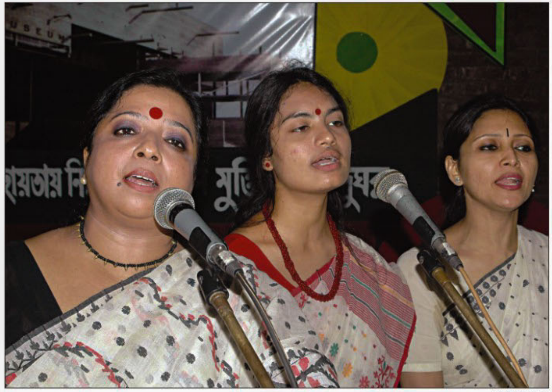
Artists perform at the inaugural ceremony of a seven-day programme at Liberation War Museum in the city yesterday marking the 14th founding anniversary of the museum.