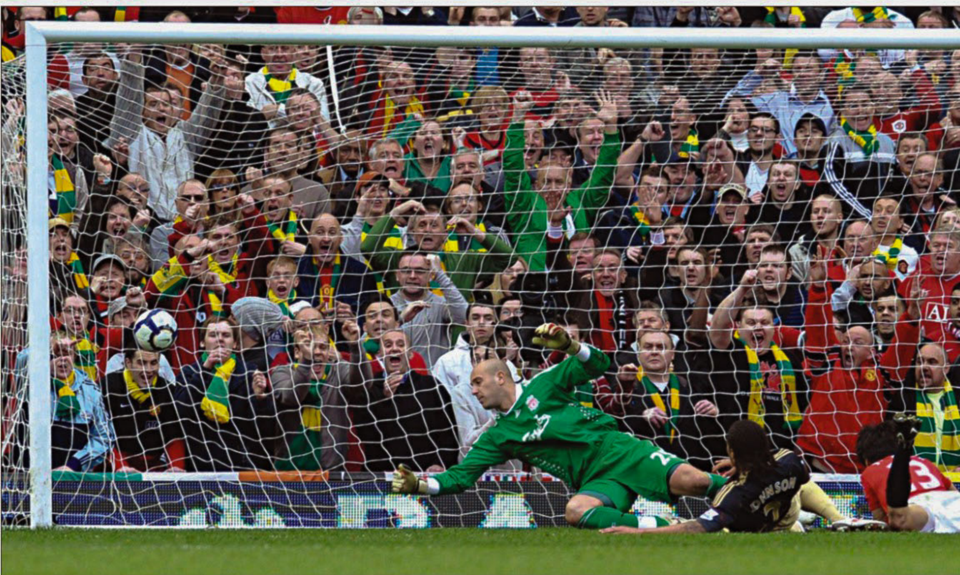
Manchester United midfielder Park Ji-Sung (R) scores the winning goal with a diving header past the despairing dive of Pepe Reina in their derby encounter against Liverpool at Old Trafford yesterday.