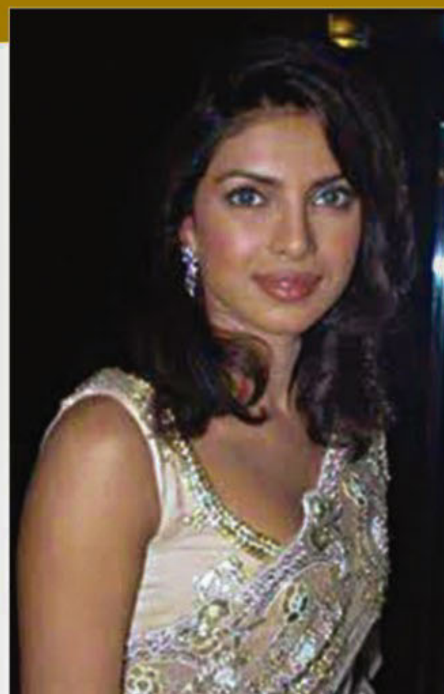
Oye!" was given the award for the best popular film providing wholesome entertainment.