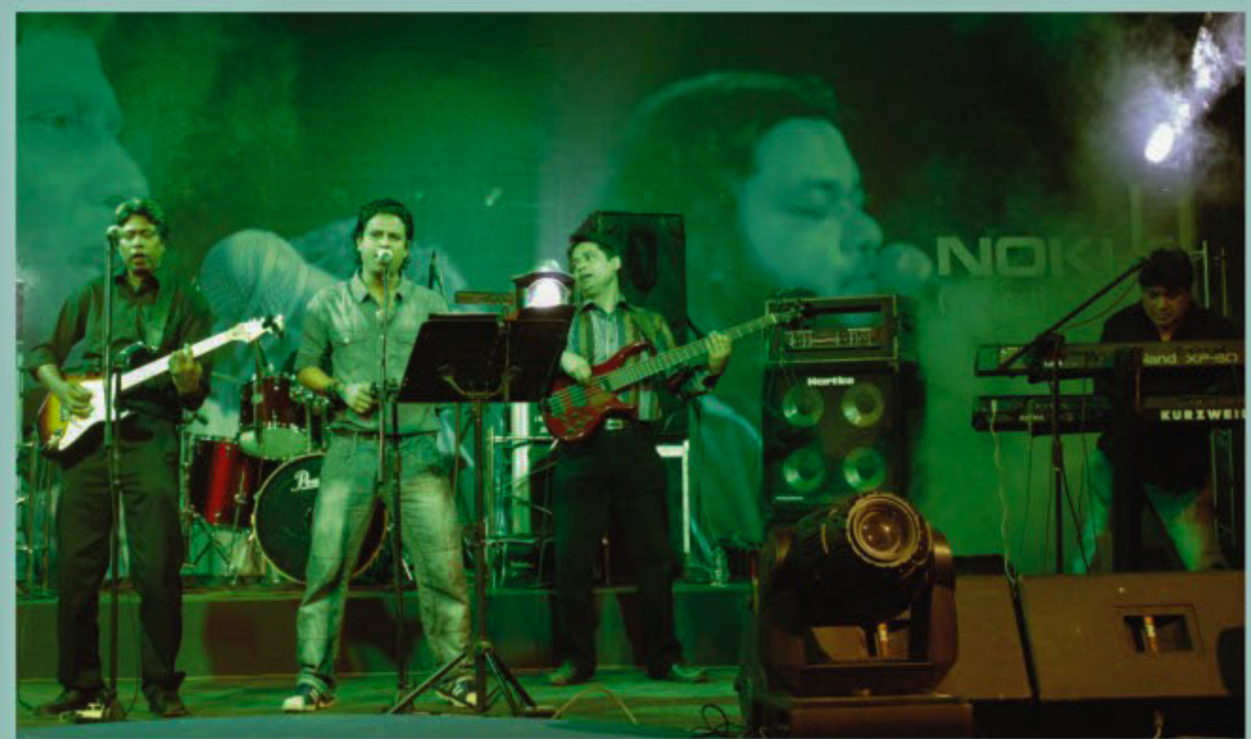
Feedback performs at the event.