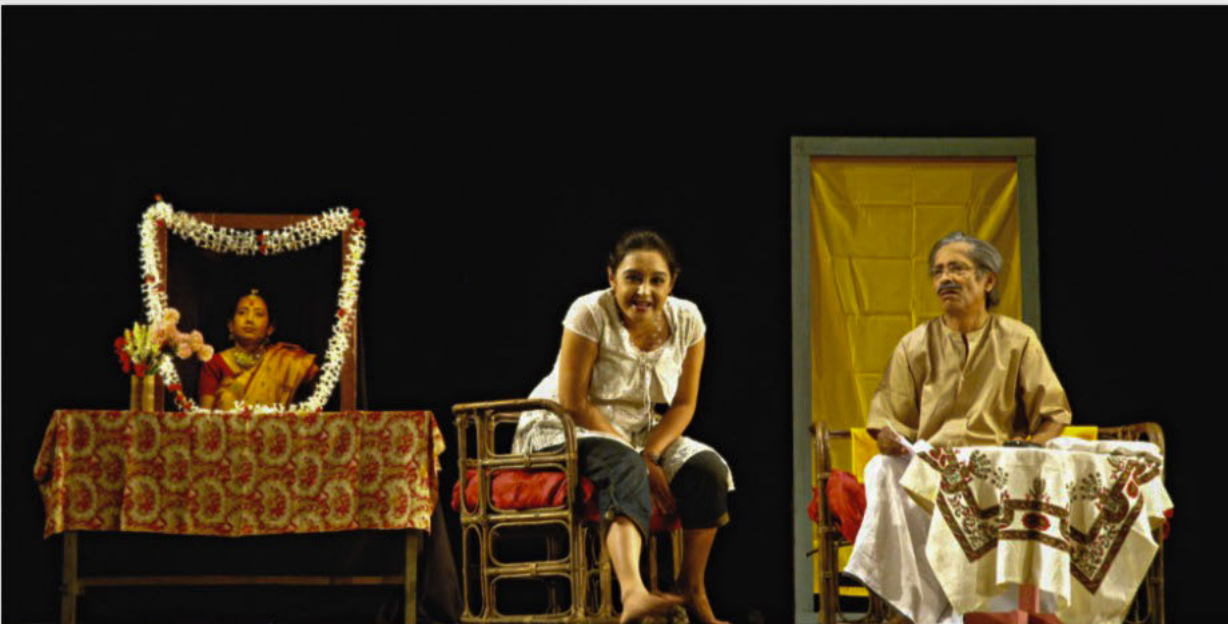
Actors of Lokkrishti in the play "Teen Number Chokh".

"Teen Number Chokh" staged on opening day