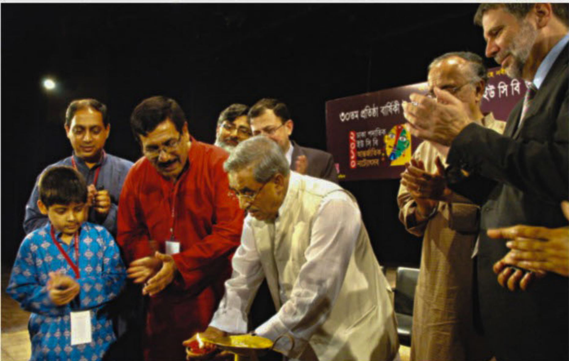
Abul Kalam Azad (centre), Minister for Information and Cultural Affairs, inaugurating the festival; also seen are Indian High Commissioner Rajeev Mitter (behind Azad) and Swiss Ambassador Urs Herren (right).