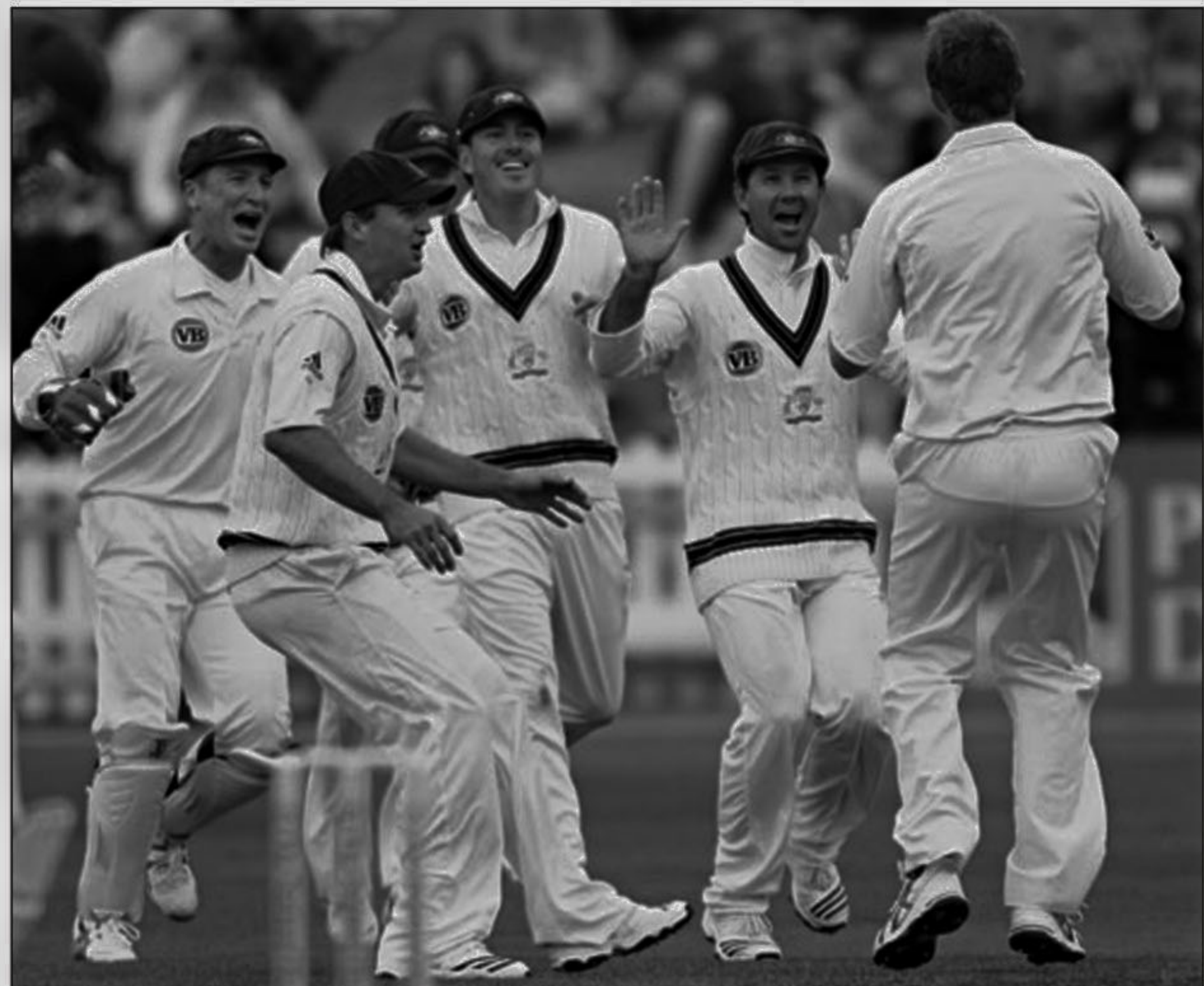
Australia pacer Doug Bollinger (R) celebrates the dismissal of Ross Taylor with his teammates on the second day of the first Test against New Zealand in Wellington yesterday.