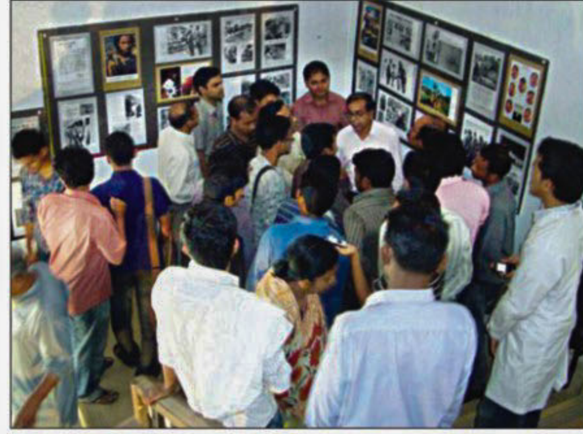
Visitors at the exhibition.