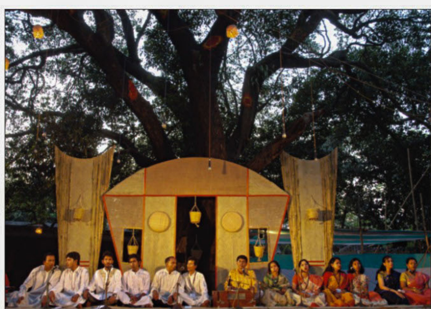
Chhayanaut artistes render a Shah Abdul Karim number.