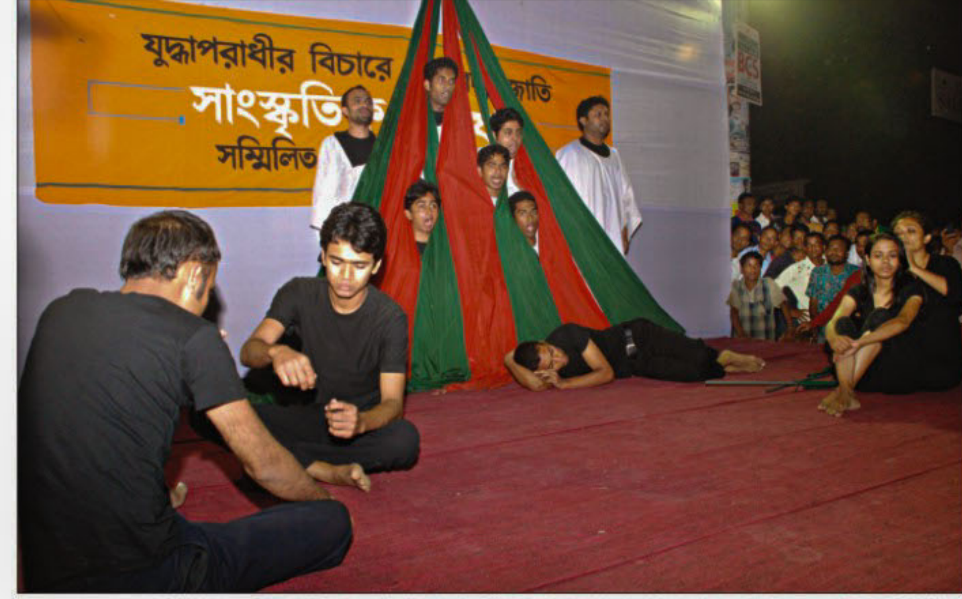
The Bogra unit of Shammilito Sangskritik Jote staged a street play "Abar Bangladesh" on March 19 at the city's Shat Matha premises. The play sought to create public awareness about the trial of war criminals.

The focus in this festival is on reflecting the grandeur of regional theatre.