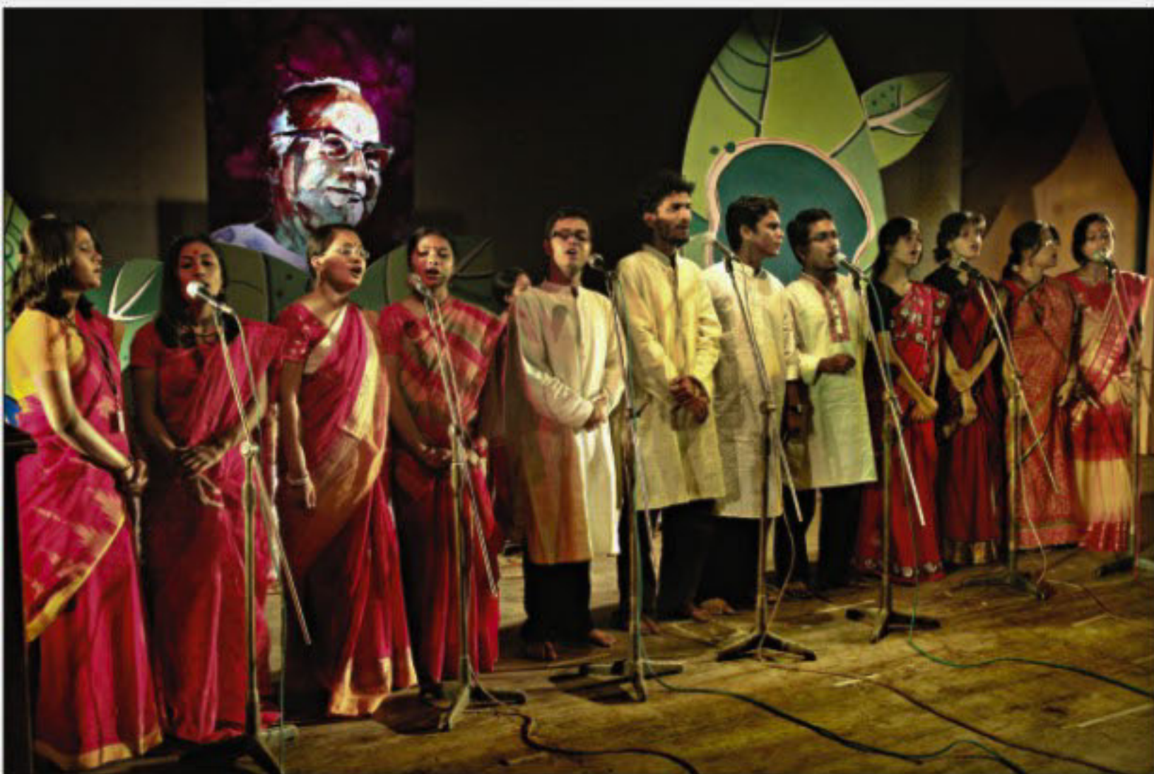
Artistes recite at the programme.