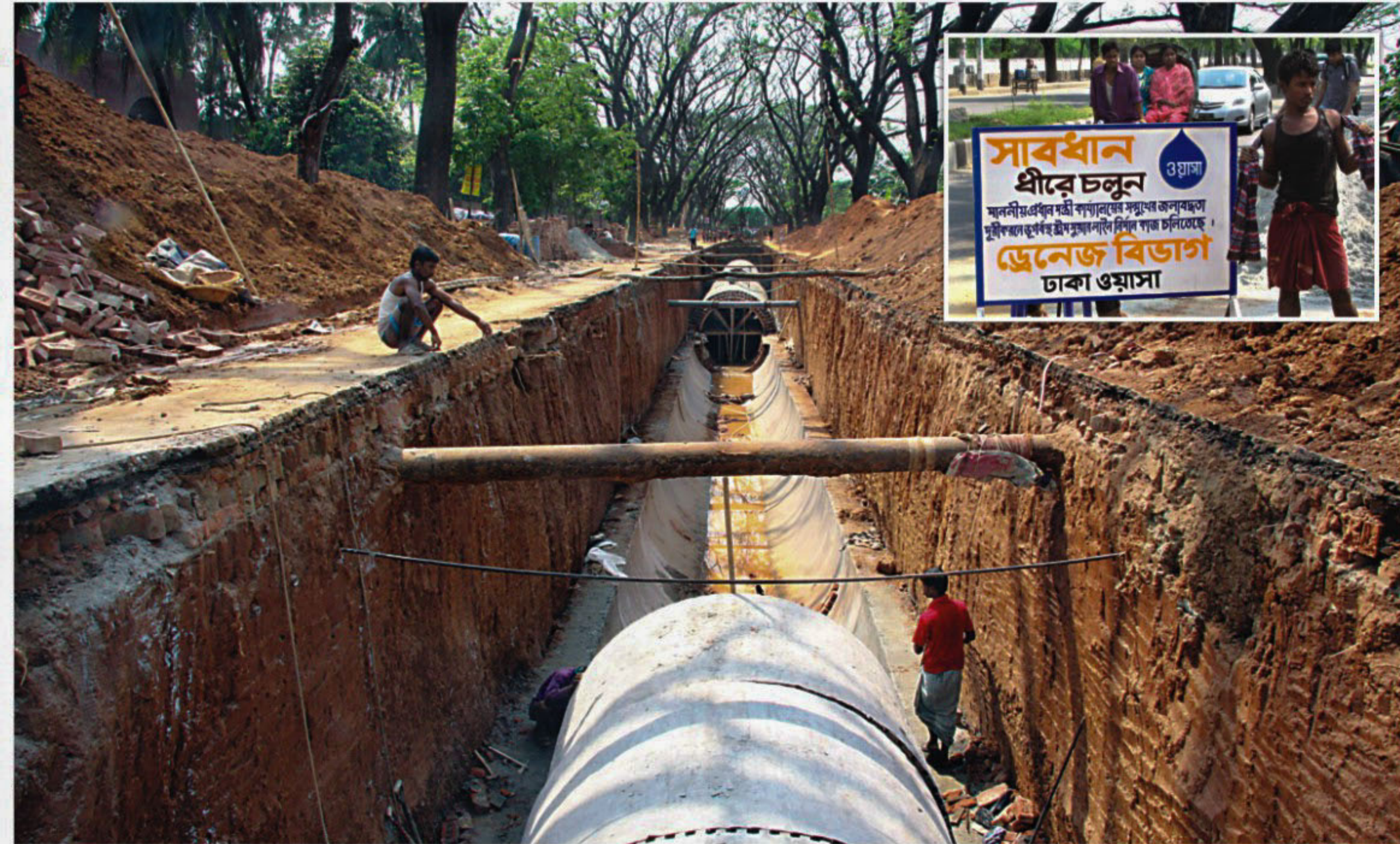
Dhaka Wassa is laying storm drains behind the Election Commission Secretariat at Sher-e-Bangla Nagar so the roads between Gono Bhaban and the Prime Minister's Office do not get waterlogged during the rains. Inset, a sign asking motorists to drive slow.