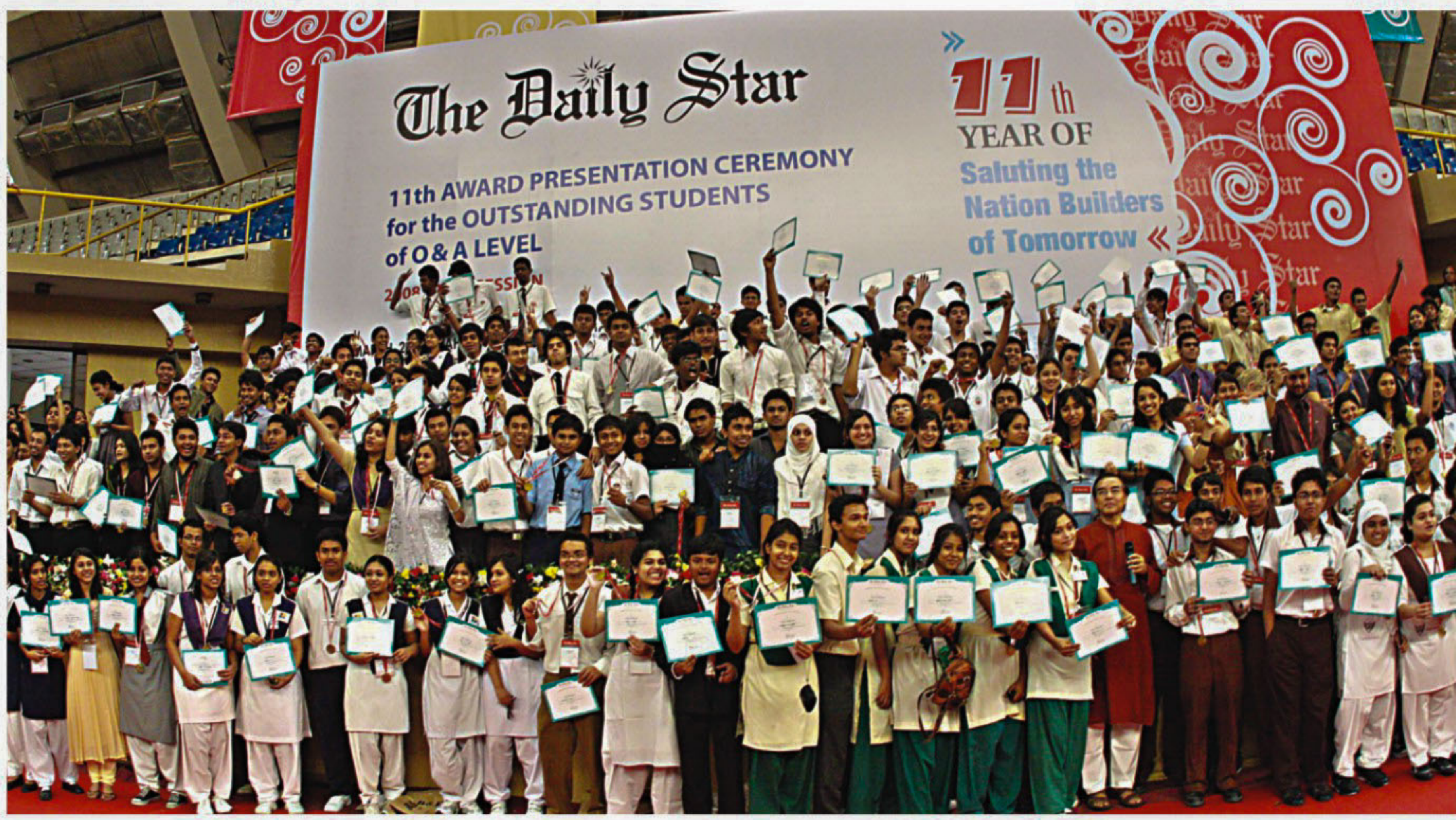
Outstanding achievers of O and A levels examinations pose for a group photo at the 11th annual award giving ceremony organised by The Daily Star at Shaheed Suhrawardy National Indoor Stadium in the capital yesterday.