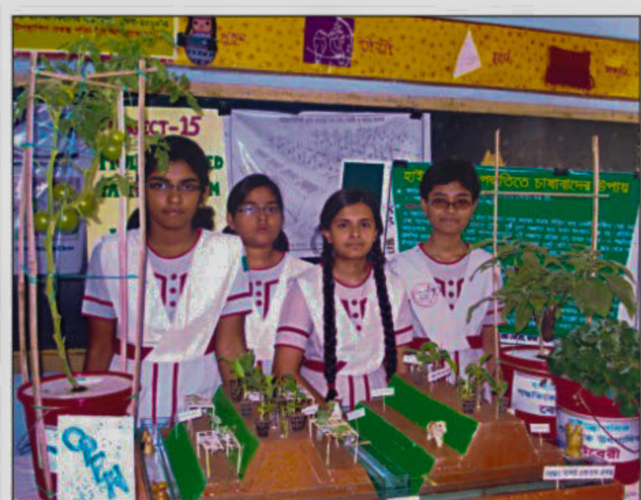
Students of Holy Cross Girls' High School display a project at a science fair on the school premises in the city yesterday.

Under-Construction Apartments to be ready by October, 2010 out of land owner's share in Rain Drops Project on Plot 3, Road 35, Sector 7, Uttara. 40% space open according to FAR Rules. Each Apartment approximately 1540 sqft. Ideal location fully secured. Close to Dhaka-Tongi Highway. Easy access to all sorts of conveyance, schools, mosque. Very Competitive Price Contact: Major (Retd) Iqbal Hossain, Phone: 01819557090