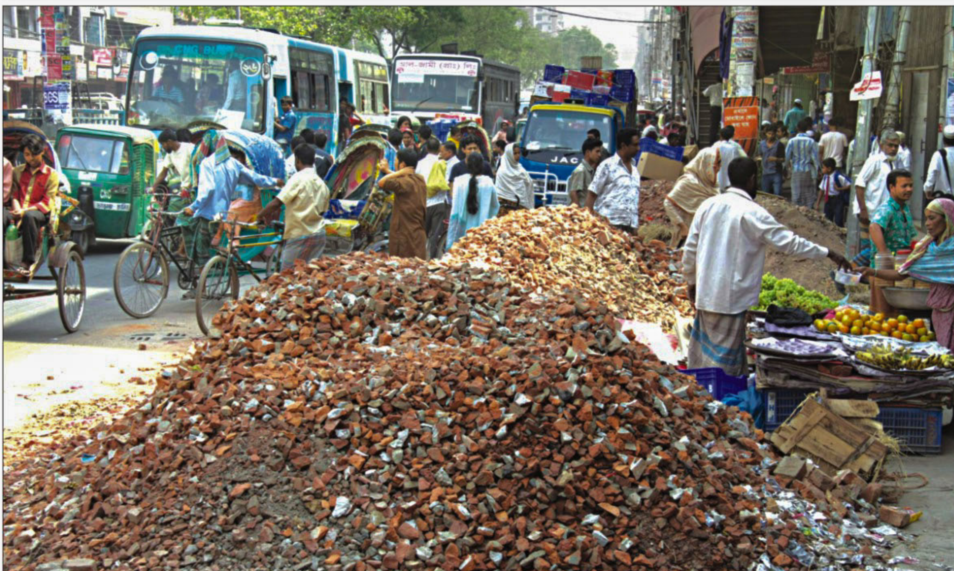
Construction materials piled up on Rokeya Sarani in front of Kazipara mosque in the city obstruct movement of vehicles as well as pedestrians. The photo was taken yesterday.

In addition to the award ceremony, The Daily Star from the last year has been organising Bangla cultural functions for English medium schools to showcase the high level Bangla cultural activities carried out in those schools.