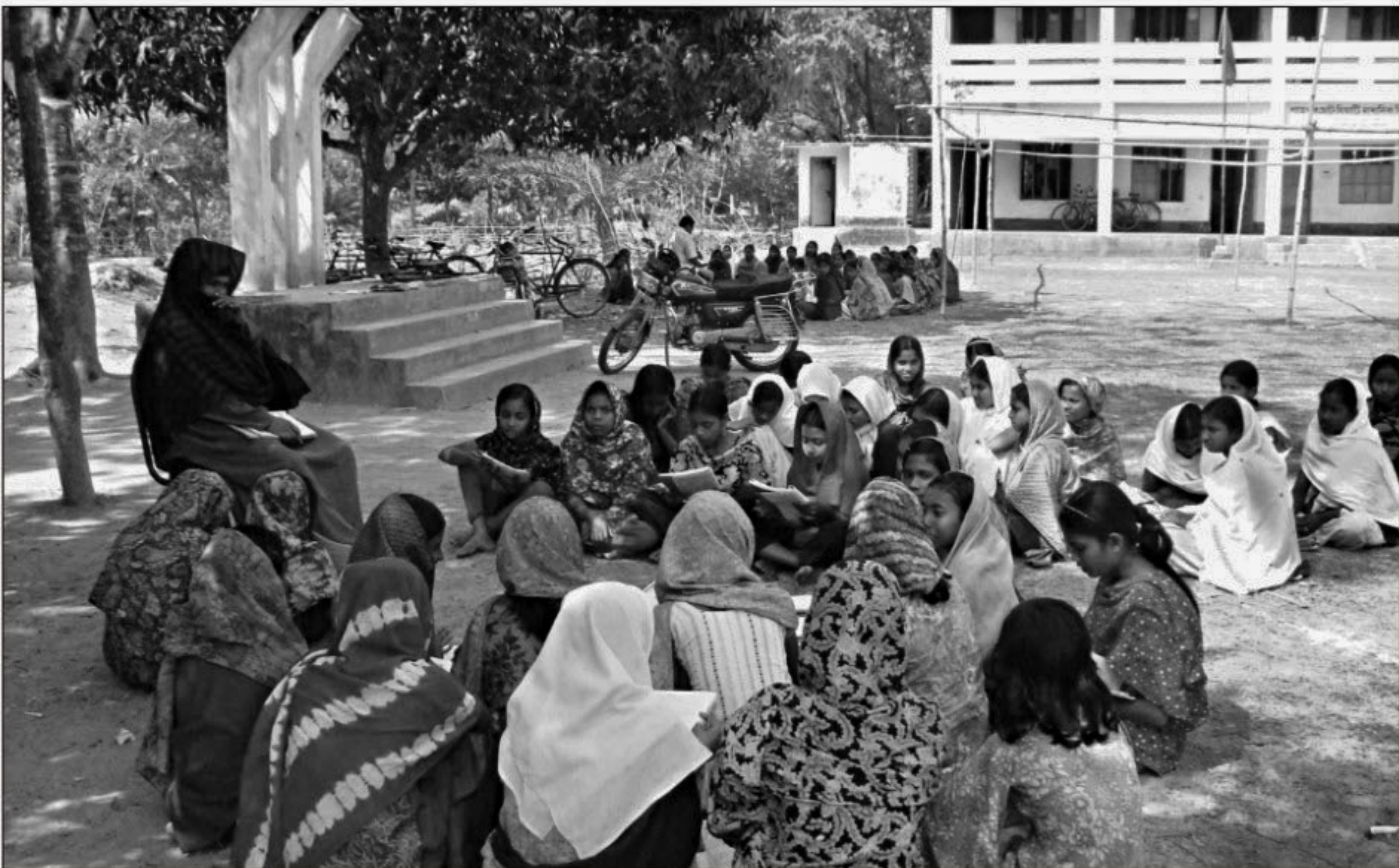
Students of Shahpur Ghighati High School in Kaliganj upazila of Jhenidah district attend classes under the open sky as floors of a few classrooms are too rough to sit on while 50 benches of the school were taken for SSC examination centres at Naldanga Bhushan Pilot High School and Salimunnesa High School. Sixteen institutions in Kaliganj upazila suffer the similar problem, especially during the SSC examinations.