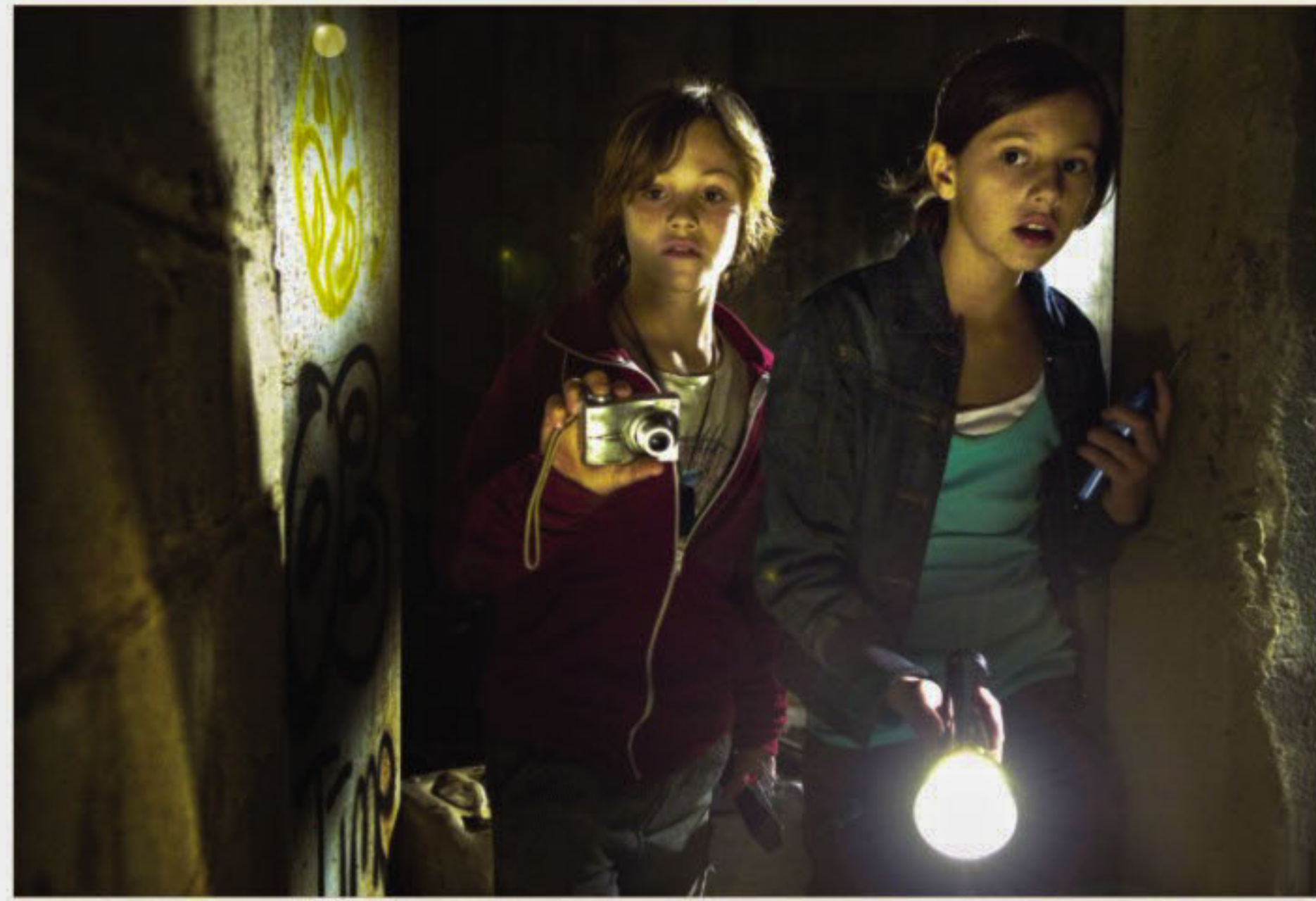
"The Crocodiles", one of the films to be screened at the festival.