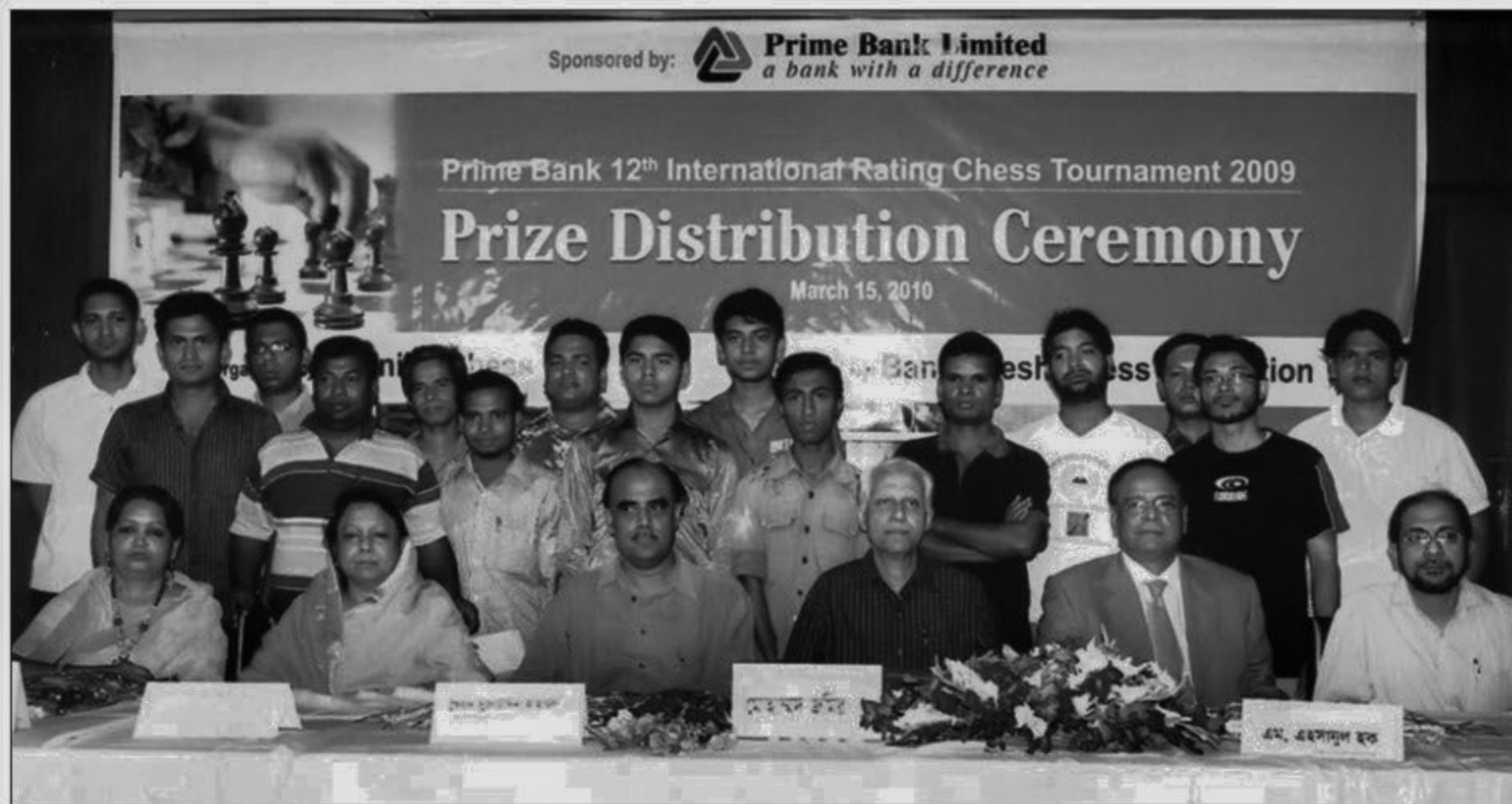
Winners of the Prime Bank 12th International Rating Chess Tournament are seen with the guests during the prize distribution ceremony at the conference room of the National Sports Council yesterday.

Real have dropped just 13 points in the title race as have Barcelona. As it stands Real are top on goal difference after a 4-1 thumping of Valladolid on Sunday.