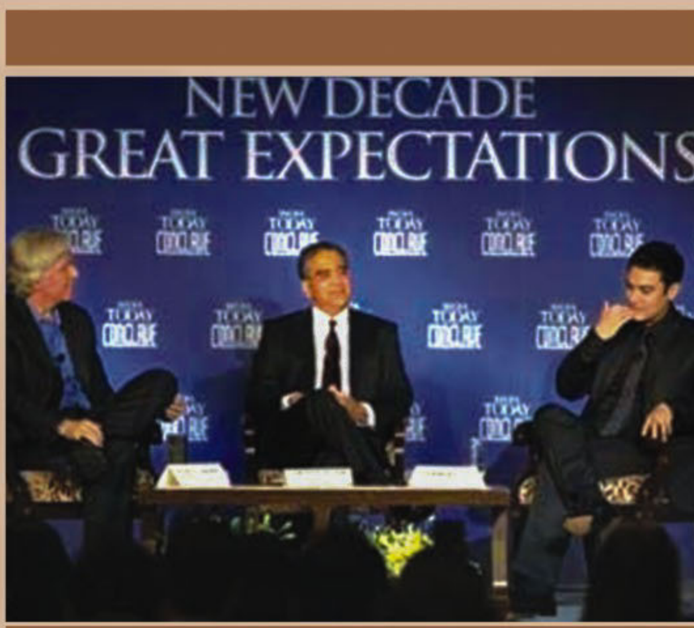
(From left) James Cameron, Aroon Purie (Editor-in-Chief of India Today) and Aamir Khan at the India Today Conclave 2010.

A college dropout, a filmmaker who sold his script for "Terminator" for one dollar on the condition that he direct it, and then went on to give us blockbusters like "Titanic" and "Avatar", James Cameron wowed actor and director Aamir Khan along with everyone in the audience at The India Today Conclave 2010, whose theme was 'New Decade: Great Expectations' on March 13. Held at The Taj Palace Hotel in New Delhi, the session was chaired by editor in chief of the India Today magazine, Aroon Purie. The event was attended by the crème de la crème of society, all eager to hear what the two trend-setting filmmakers had to say about The Future of Cinema. The Oscar winning director shared what it was like to have a dream, and then to go ahead and realise it. At a time when 3-D films were almost unheard of, James Cameron decided to take the plunge and bring in a technological revolution that few had faith in. But Cameron knew this was just something he had to do. But there was one big hurdle in his way -- the fact that few theatres were equipped to show 3-D films. That's where "Avatar" came in -- the dream was to make a film so big, so exciting and so irresistible that the theatres couldn't ignore it. "Avatar" is a film that was written 10 years before it was made. I had almost forgotten about it, but when