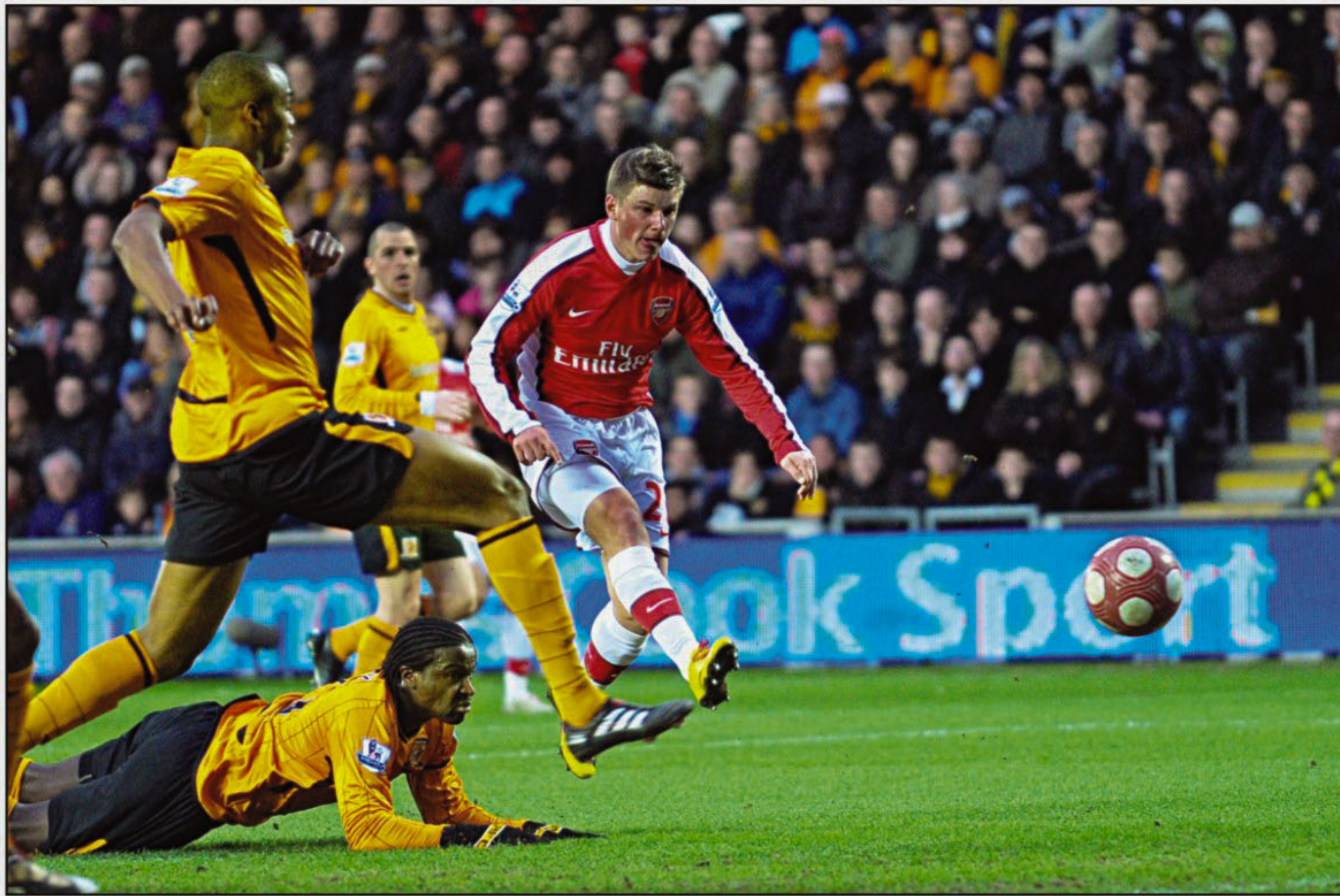
Arsenal midfielder Andrei Arshavin (R) volleys home the opening goal in their Premier League clash against Hull City at the KC Stadium in Kingston on Saturday.

Former Ivory Coast coach Vahid Halilhodzic was axed after the team failed to make the African Cup of Nations semifinals in January.