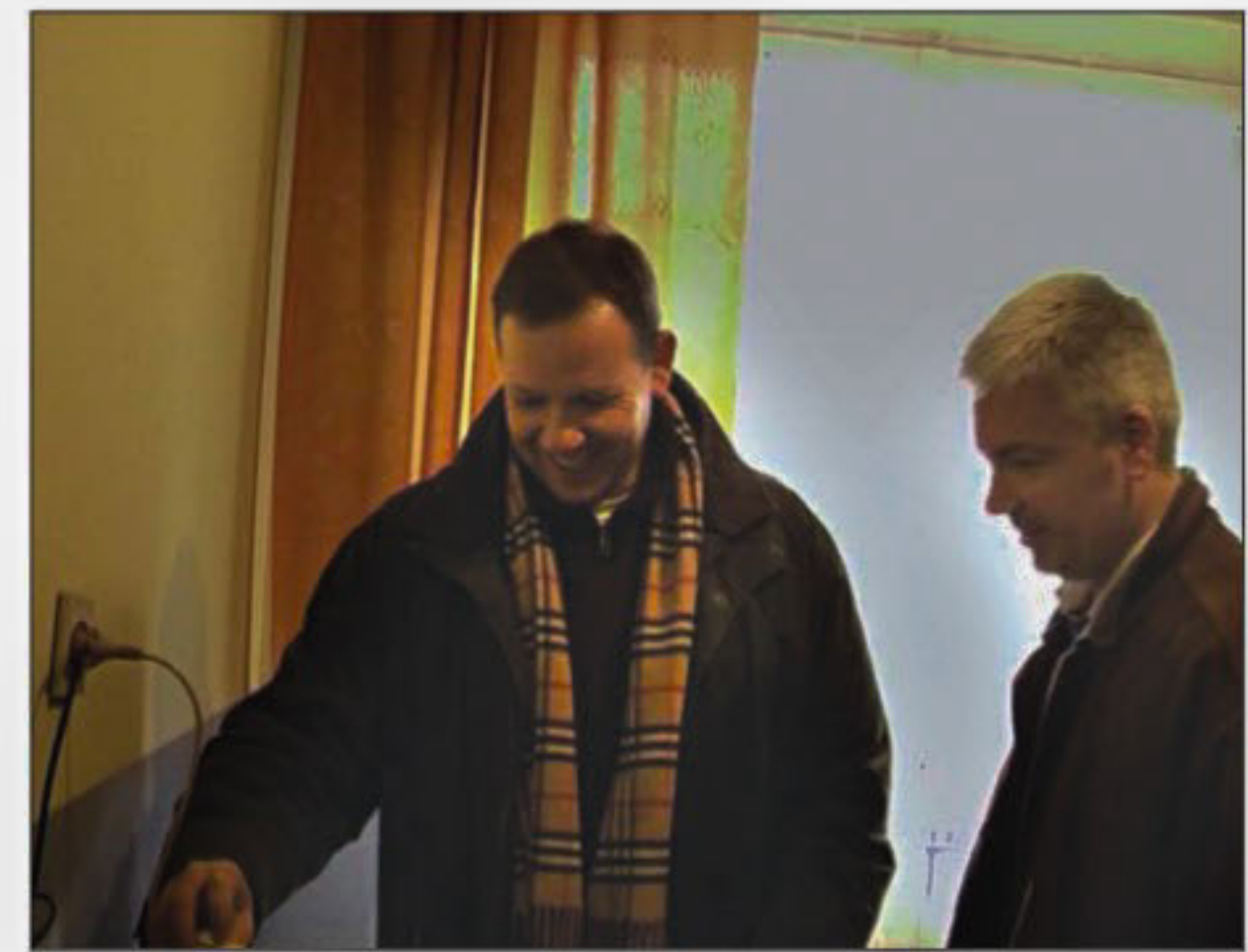
Glimpses from the award winning films "The Rest Day" (L) and "Rouge Nowa Huta".