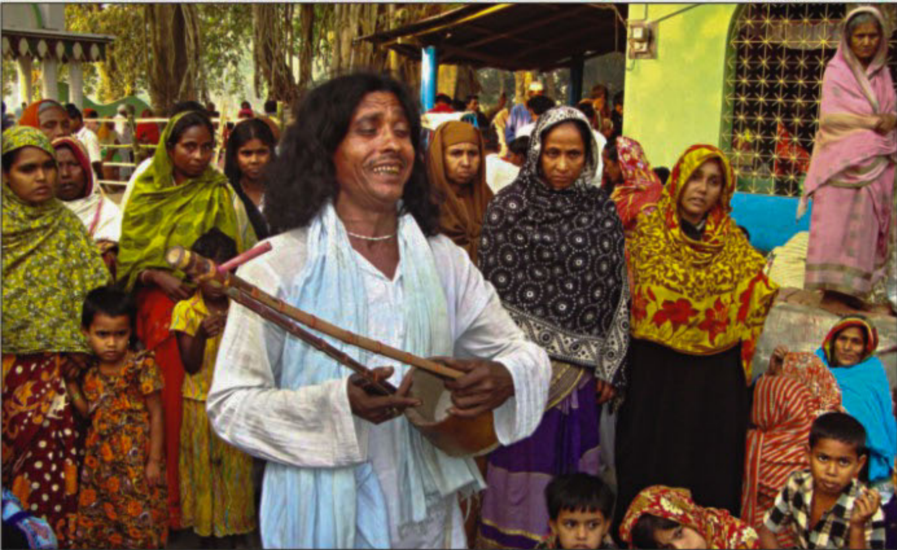
A baul in his element at the shrine.