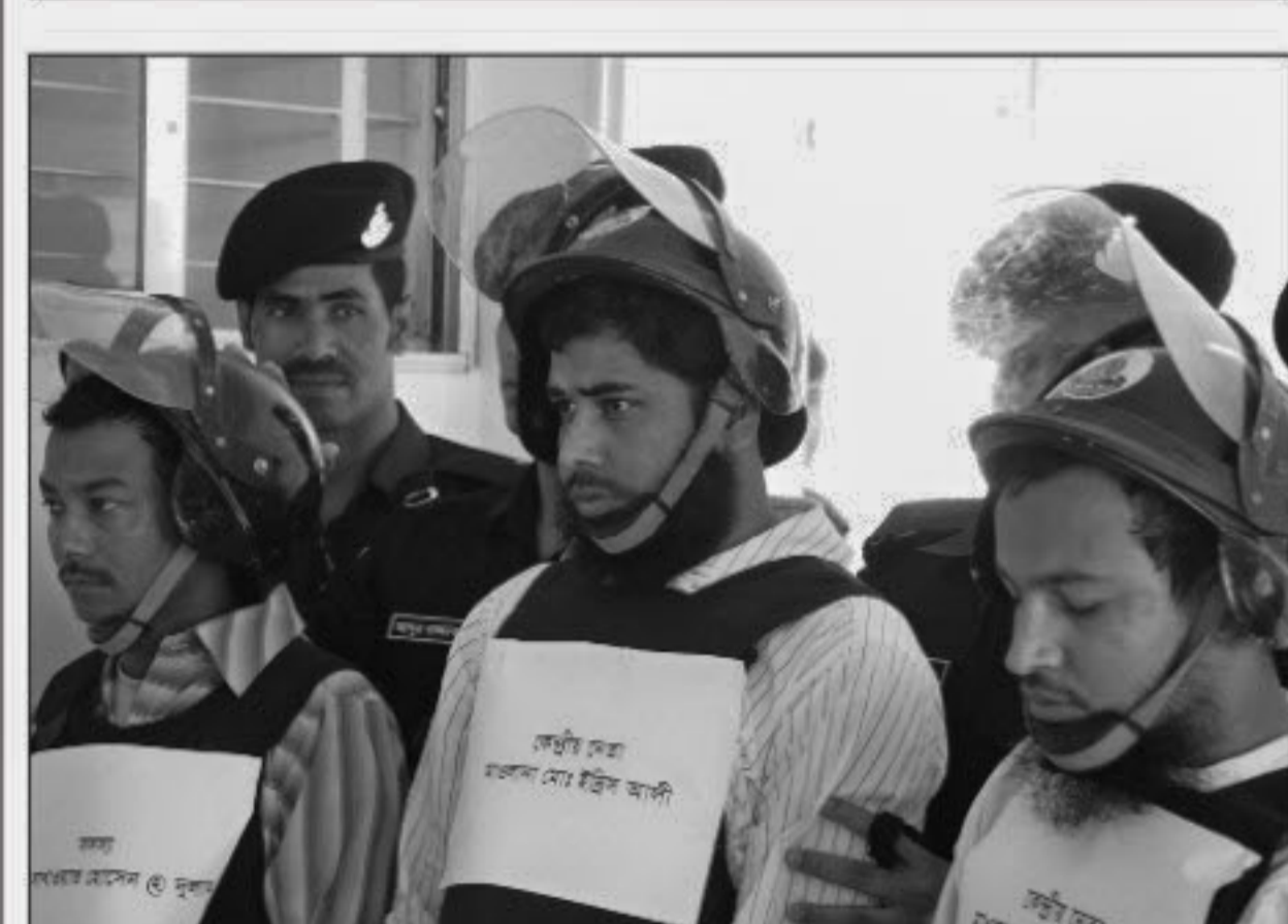
Rapid Action Battalion (Rab) members in connection with the bomb blasts that killed five people during a Communist Party of Bangladesh rally in 2001. (Story on Page 16)

Earlier on Saturday, AL General Secretary Syed Ashrafur Islam, also LGRD and cooperatives minister, asked BNP Chairperson Khaleida Zia to disclose the evidence of allegations brought against Joy within a week.