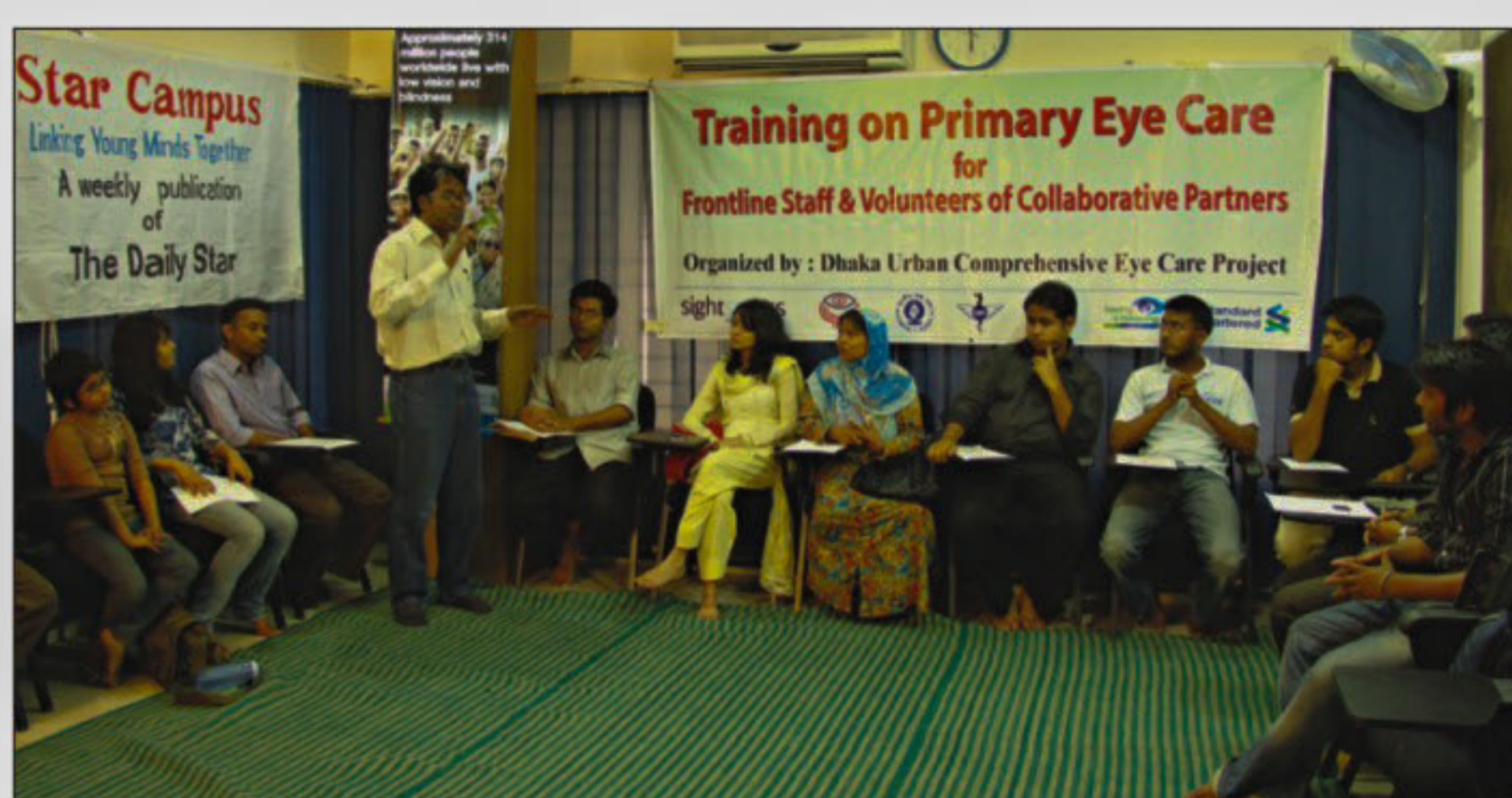
Dhaka Urban Comprehensive Eye Care Project and Star Campus, a weekly supplement of The Daily Star, jointly organise a training session on primary eye care at a conference centre in the city yesterday.

SALES CENTER: House No-36, Road No-13, Block-D, Banani, Dhaka-1213 Tel: 9891869, 9893827, 9873165, 8857067, 8851026, 8814056, 9888824 8819742, 8810266, 8829797, 8837356, 8837357, 8833983, 8836918 Cell: 01819 263044, 01817 044554, 01817 143885, 01817 143881, 01817 044555 01817 158304, 01817 295285, 01817 143325. web: www.dominno-bd.com *sms charge applicable