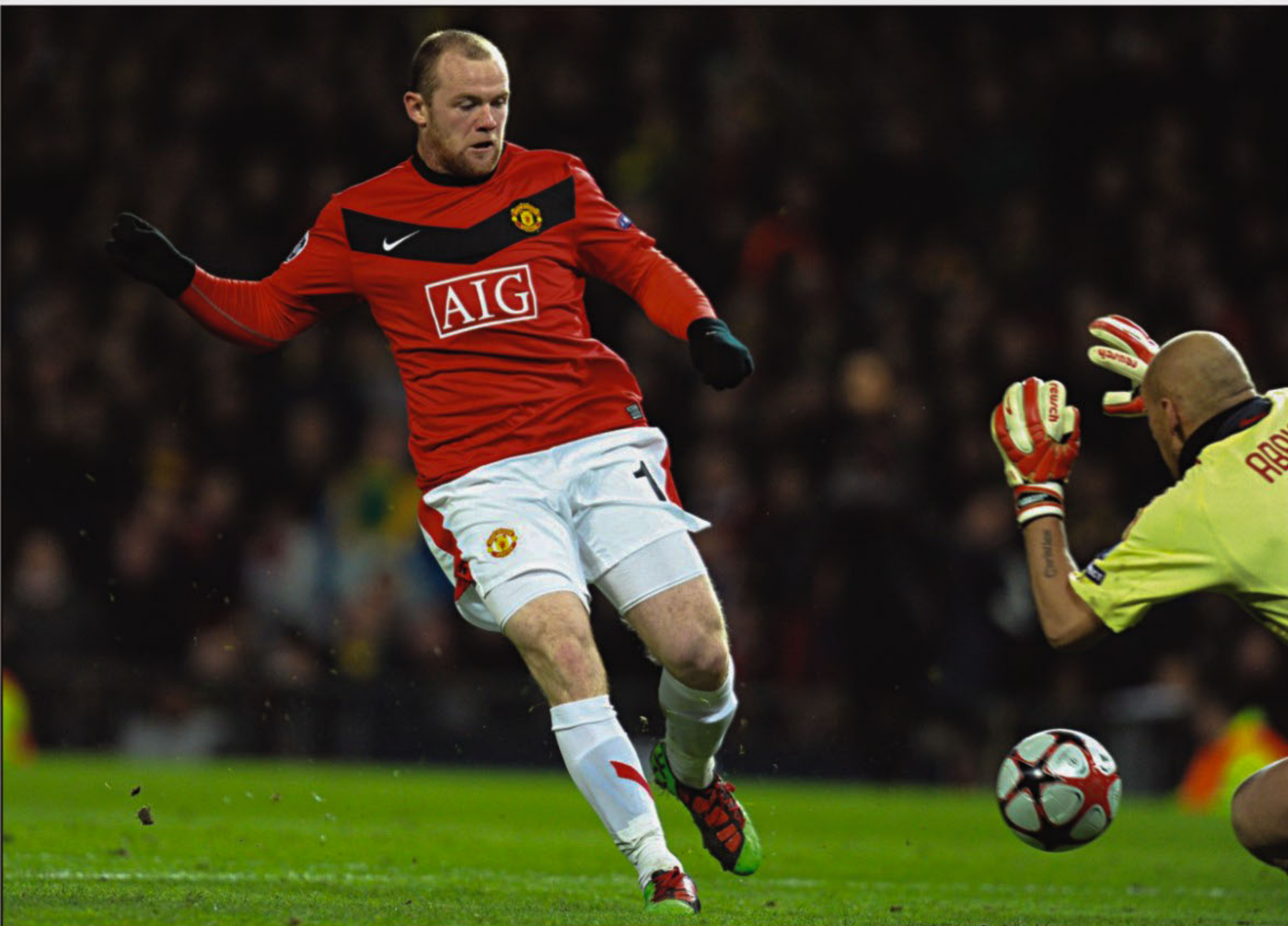
Manchester United star Wayne Rooney (L) scores the second goal past Milan goalkeeper Christian Abbiati during their champions league encounter at Old Trafford on Wednesday.