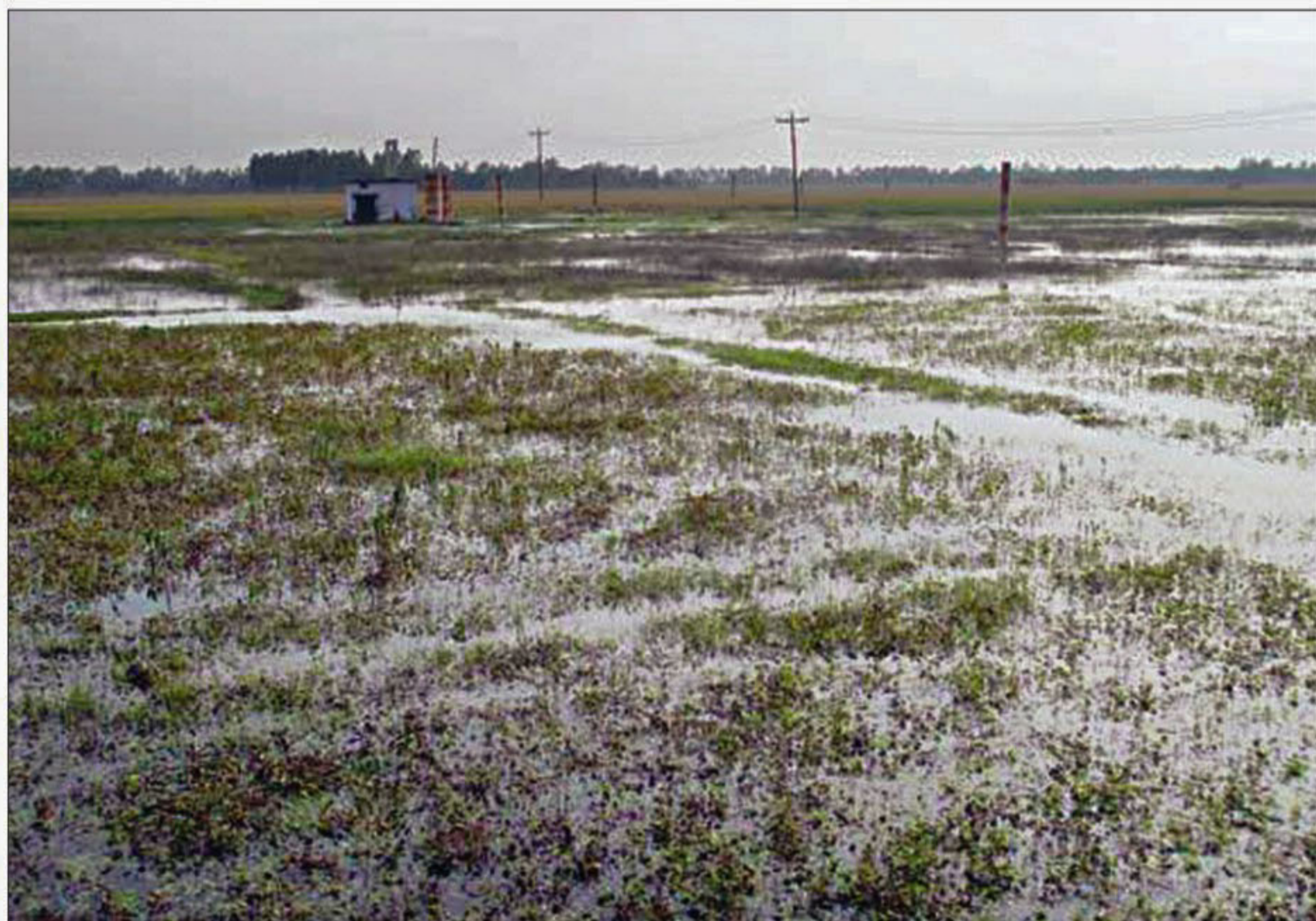
Flooded farmlands at Bolorampur village near Barapukuria Coalmine in Phulbari upazila of Dinajpur district have turned into uncultivable area following land subsidence due to geographical faults caused by underground mining.

The frequent land subsidence badly affected the arable land at different villages including Kalupara, Bolorampur, Gigagari, Bashudevpur, Moupukur, Patigram, Kashidanga and Palpara, they said.