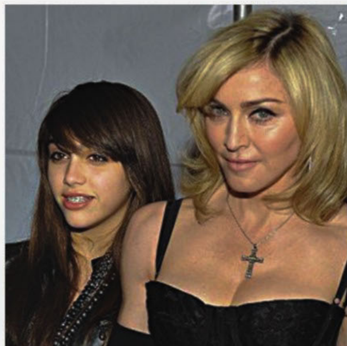
Madonna and her daughter Lourdes