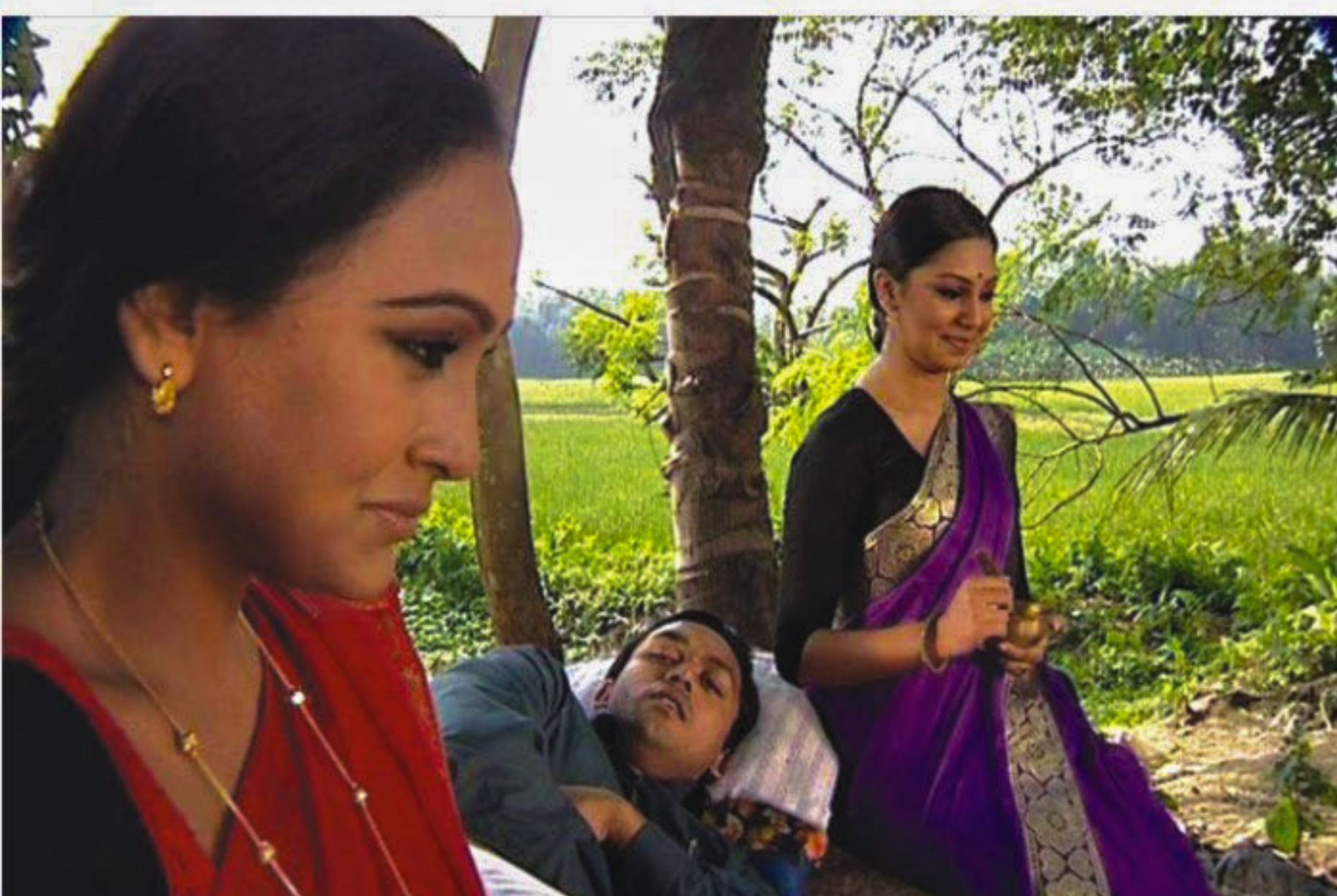
The serial has been shot in a village in Manikganj.

About the location, Chowdhury said, "The village is so beautiful that we instantly fell in love with it. It's a sanctuary for thousands of birds. We encountered some difficulties during our stay but on the whole the project was satisfying."