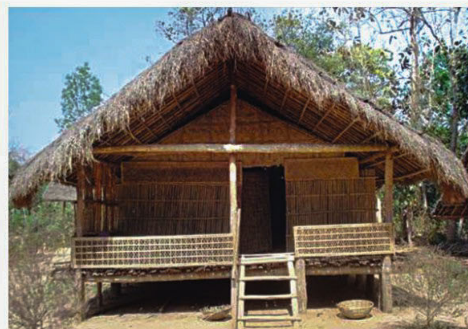
Nokmandi, a traditional Garo hut.

The Semp project is currently the only initiative to preserve the traditions of these indigenous communities. The modest museum at Madhupur forest