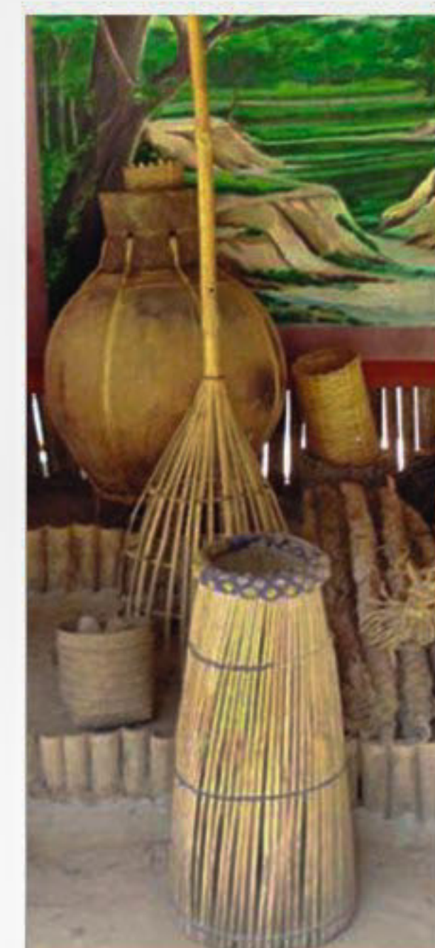
Fishing tools used by the Koch.