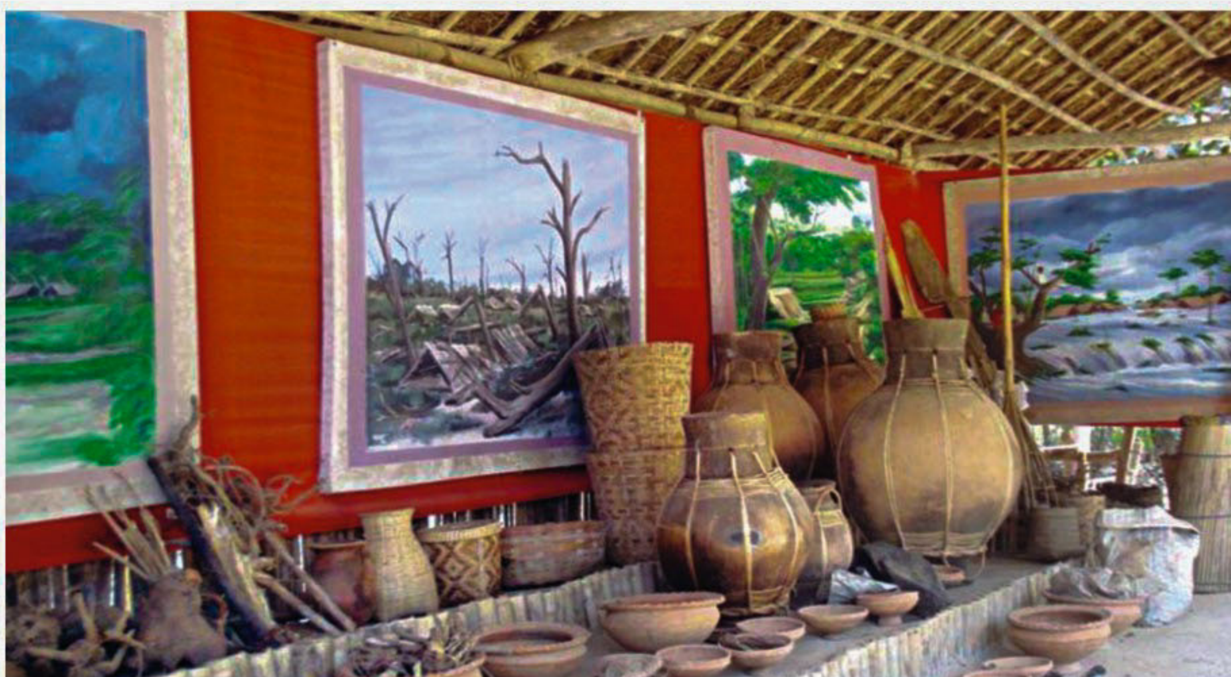
The museum houses around 80 traditional items used by the Garo, Koch and Hajong communities.