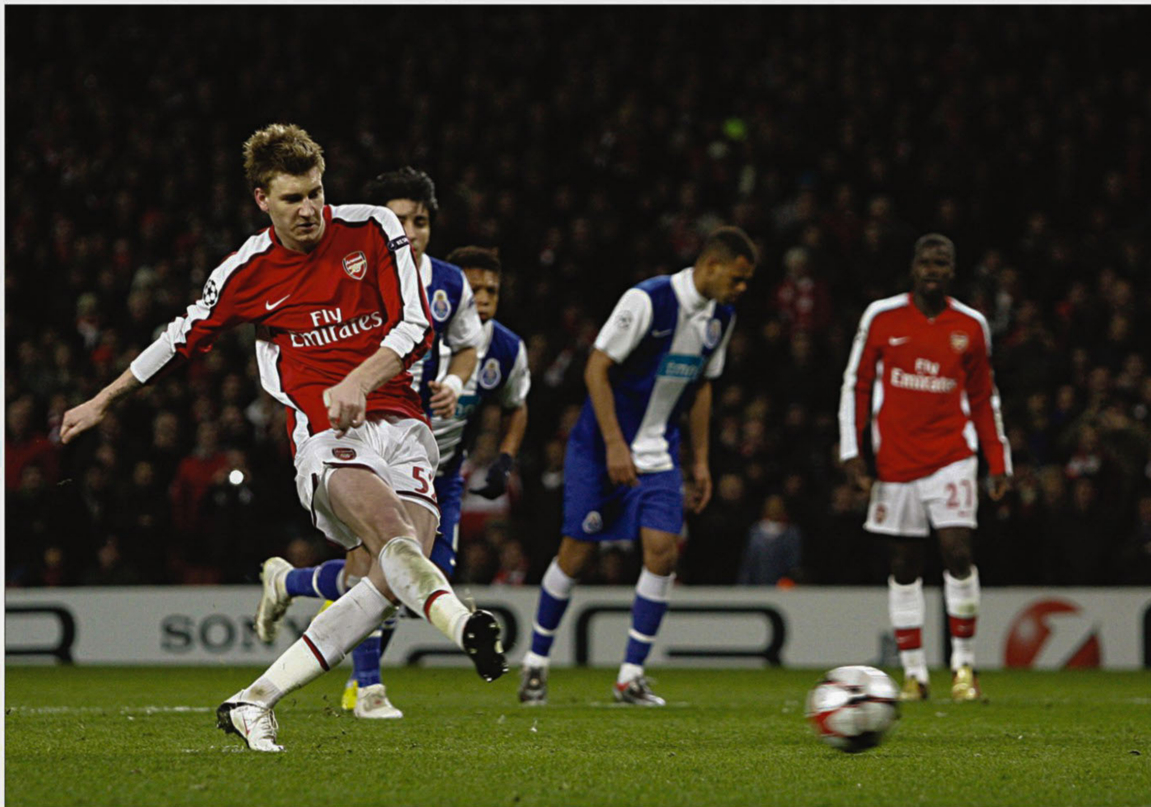
FINAL NAIL IN THE COFFIN: Arsenal striker Nicklas Bendtner (L) completes his hat-trick from a spotkick to make it 5-0 during their champion's league encounter against Porto at the Emirates Stadium on Tuesday.

The toy and gift manufacturer also produced merchandise for the 2008 Olympic Games in Beijing and is a supplier for this year's World Expo in Shanghai, according to its website.