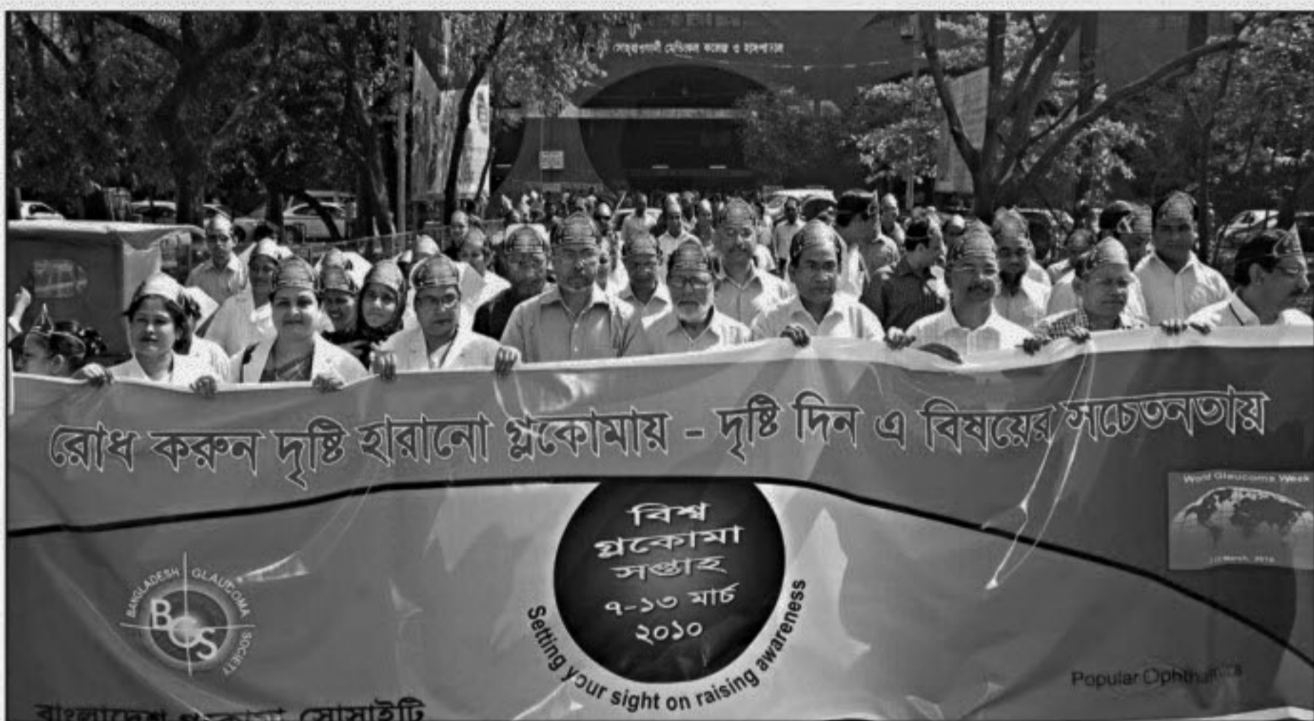
Glaucoma Society takes out a procession from Suhrawardy Hospital in the city yesterday to raise awareness about glaucoma on the occasion of the World Glaucoma Week.