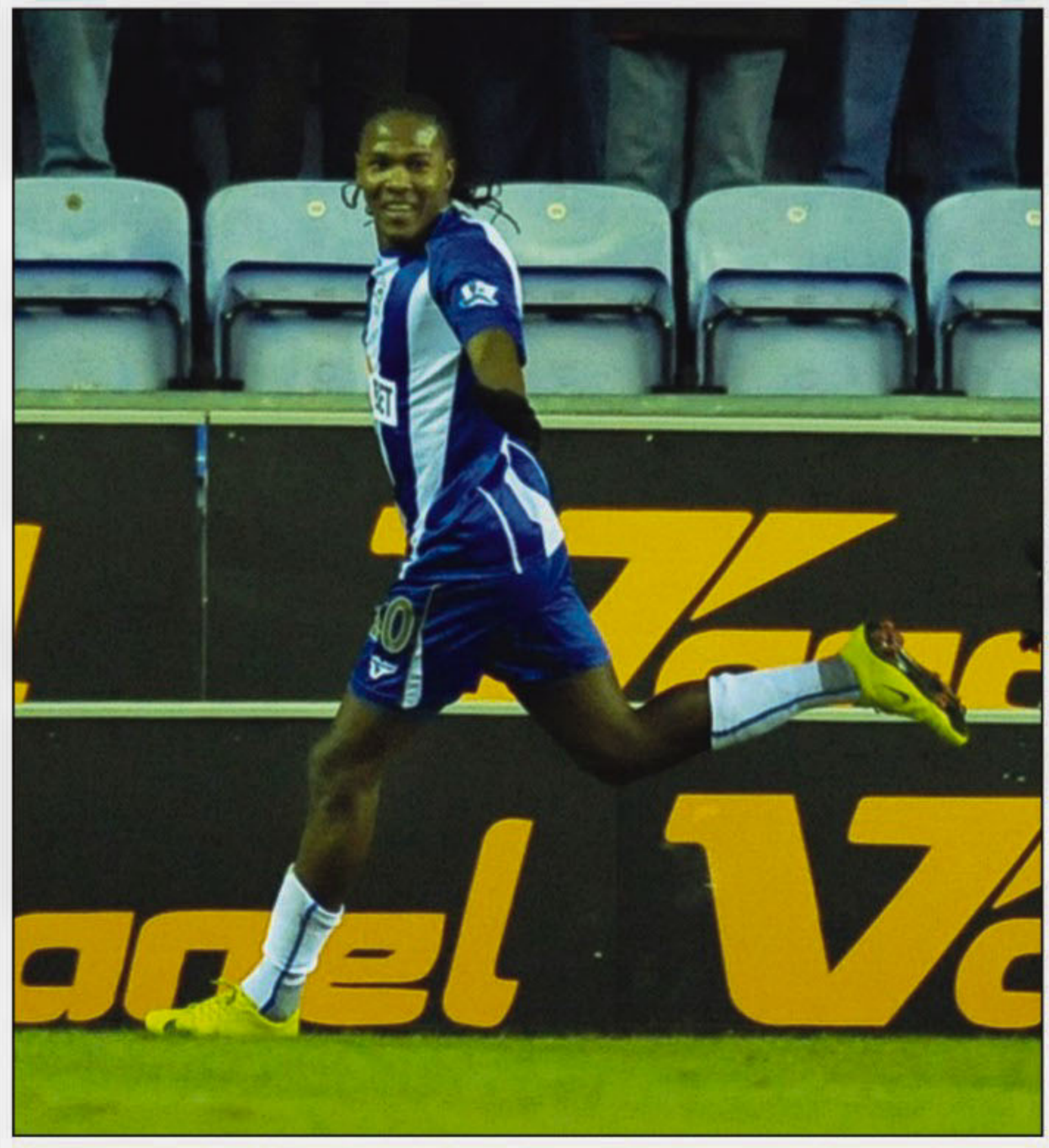
Wigan Athletic forward Hugo Rodallega celebrates his all-important goal against Liverpool during their Premier League encounter at the DW Stadium on Monday.