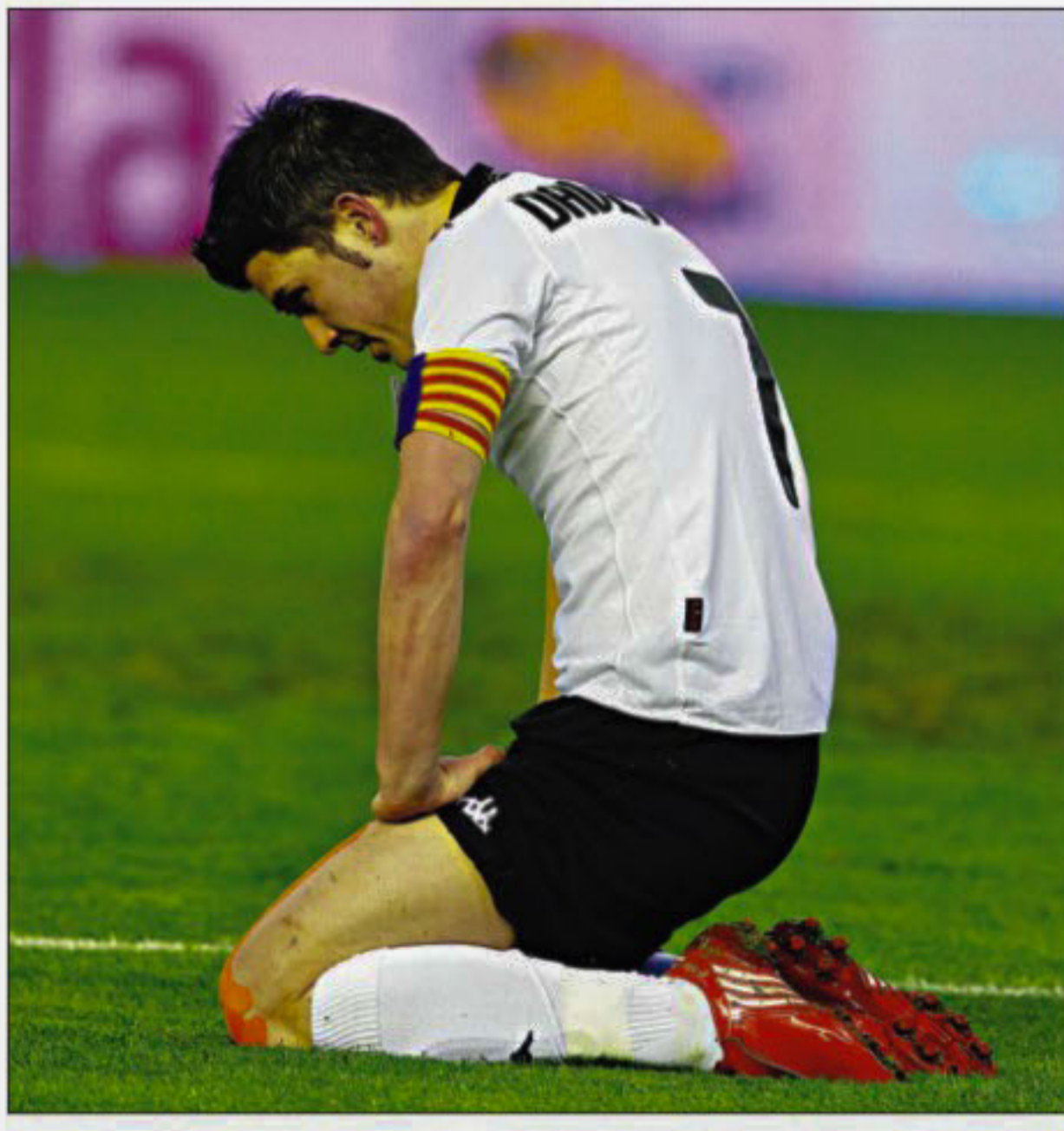
Valencia star David Villa reacts during their Primera Liga clash against Racing Santander at the Mestalla on Monday.

"We were unable to finish off chances and that has cost the team points. Maybe we had a different mentality against a team of the quality of Valencia than we do against sides of our level where we try and play more football," he added.