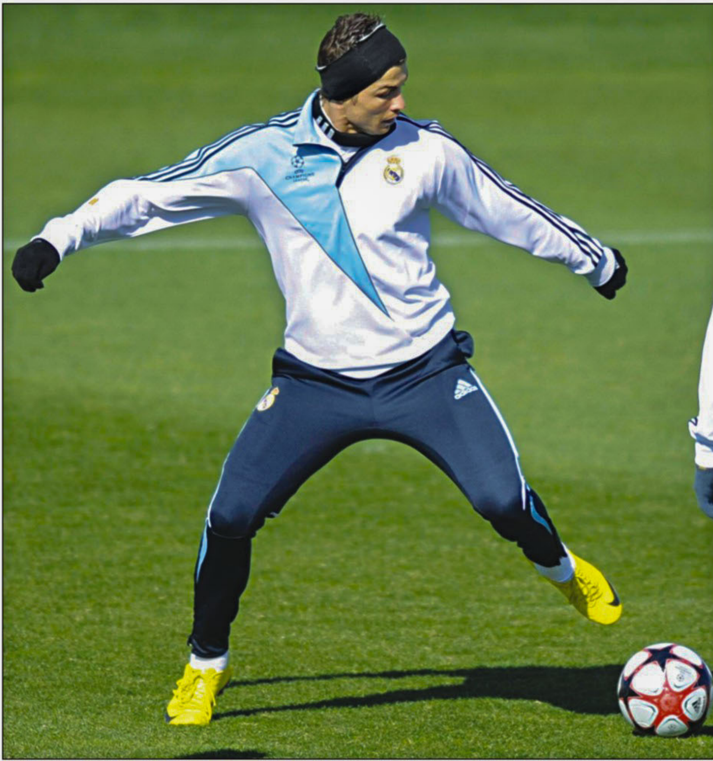
Real Madrid star Cristiano Ronaldo is about to kick the ball during a training session in Madrid on Tuesday on the eve of their Champions League match against Olympique Lyon.

"We must start the match strongly, and above all watch out for their counter-attacks so as not to concede a goal," he said.